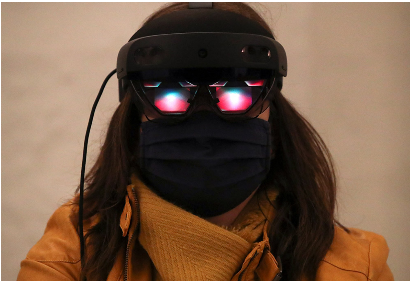
Virtual glasses using artificial intelligence are seen in this photo.

Thiel could argue that new technologies already blur the line between human and machine, and bake us into computer ecosystems: goggles or headsets that warp our vision, scanners that decode our thoughts and monitor our feelings, "smart" glasses that whisper in our ears and earbuds that harvest our brainwaves. Given this and what's on the horizon, one Washington Post cartoonist depicted the progression from computers on our desks to computers in our hands to computers on our heads to computers in our brains, threatening, as Pope Francis warns in Fratelli Tutti , to make us "prisoners of a virtual reality" who "lost the taste and flavor of the truly real."