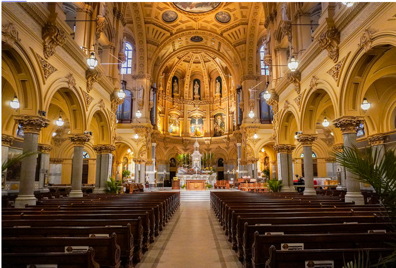
The interior of the Church of St. Francis Xavier in Manhattan, New York