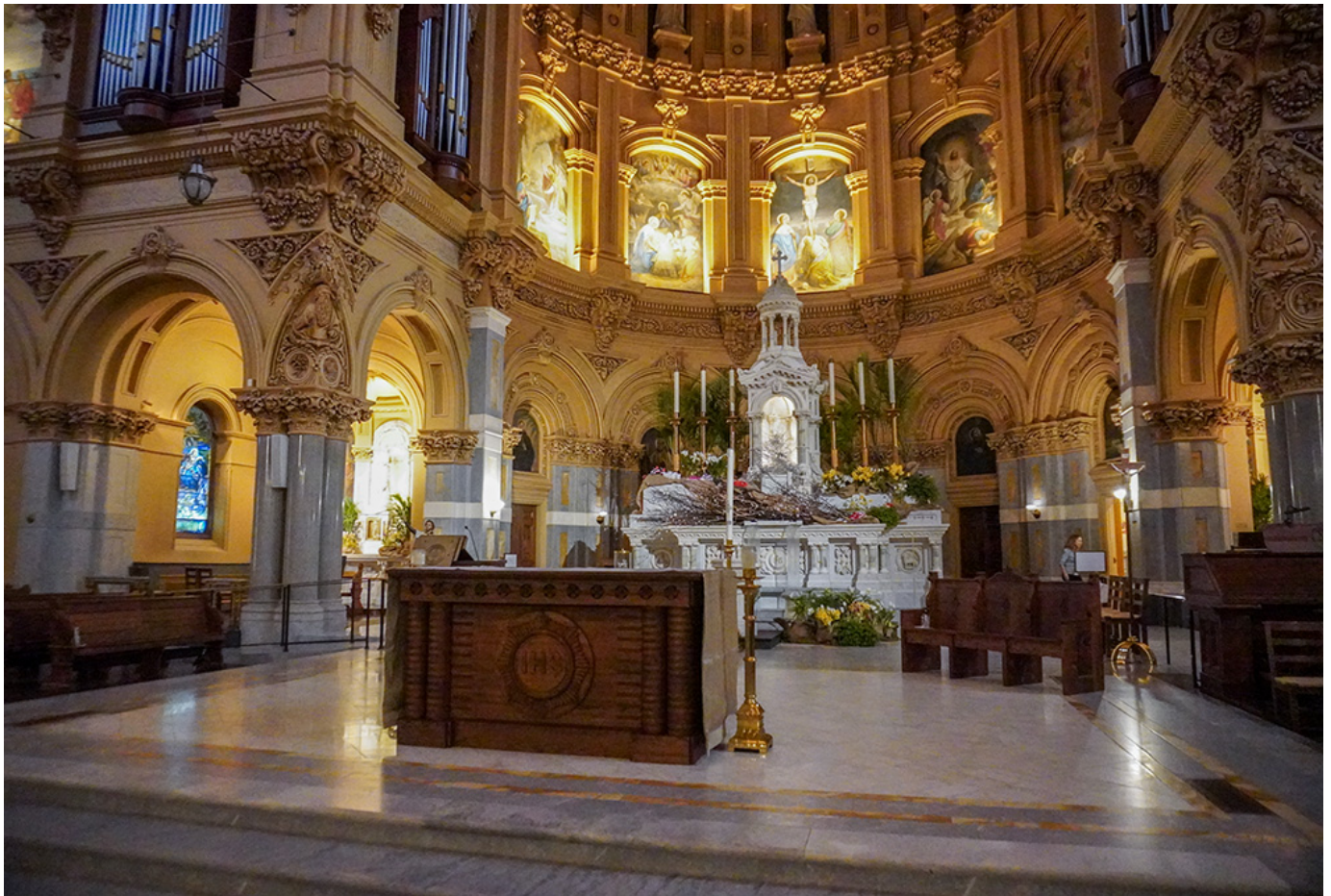
The main altar of the Church of St. Francis Xavier in Manhattan, New York