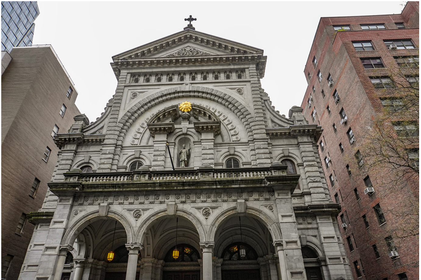
The Church of St. Francis Xavier in Manhattan, New York