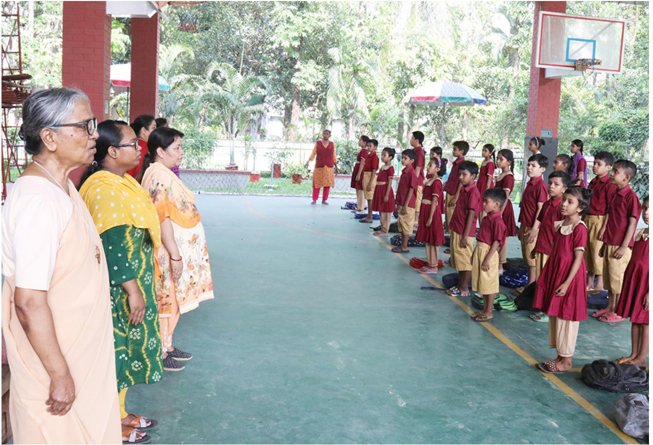
Teachers and students sing the national anthem of Bangladesh in the assembly before the start of class. (Stephan Uttom Rozario)