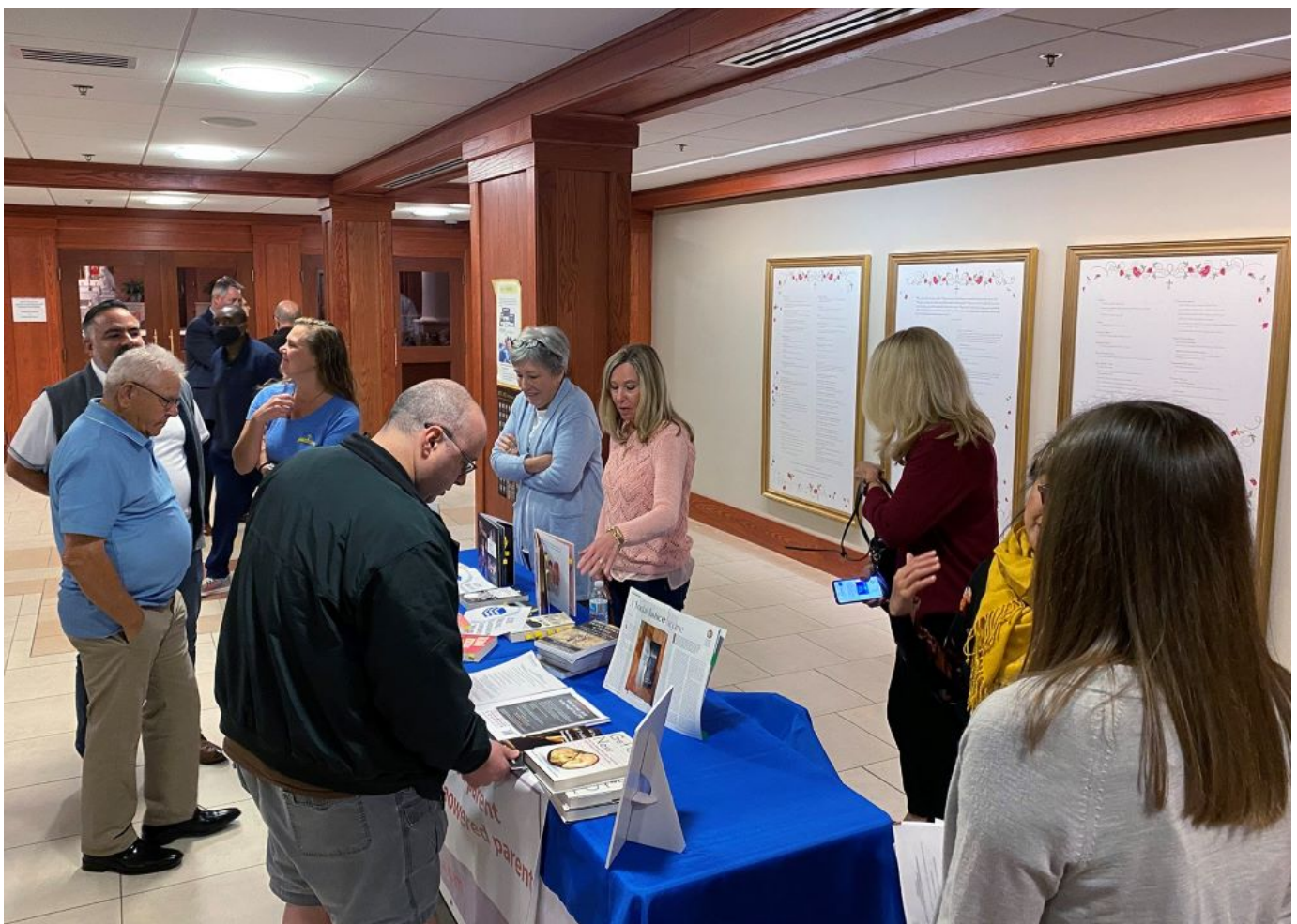
Attendees at an Oct. 23, 2021, conference on "Gender Ideology: The Cultural Challenge and the Catholic Response" browse material presented by the Parent and Child Loudoun organization at St. Theresa Church in Ashburn, Va.

"It would be important for me if I'm an educator implementing a policy to know that it was created through a multidisciplinary process, that the authors of that document represent philosophy, theology, psychology, endocrinology — all of the realms that impact the gender conversation in particular," she said. "I think any one discipline, myself included, will be incomplete in what we can offer Catholic schools."