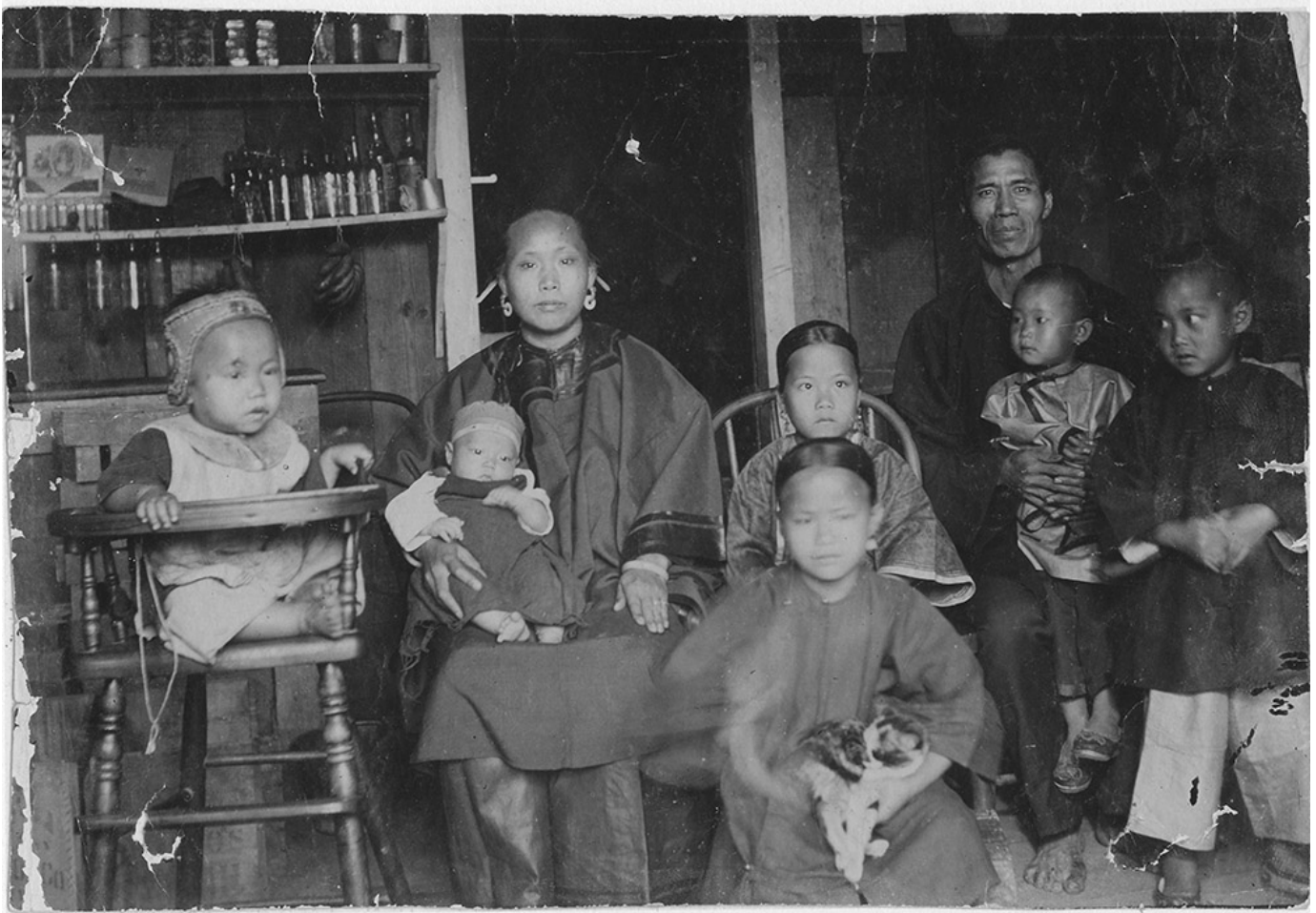
A Chinese family in Honolulu, Hawaii, in 1893. In much of the U.S., immigrants from Asia experienced intense discrimination.

Generally speaking, racial rather than religious prejudice dominated anti-immigrant politics by the late 19th century — although these boundaries blurred in the case of antisemitism against Jewish immigrants from eastern and central Europe. The popularity of "racial Darwinism" was at its height: pseudoscientific thinking that misconstrued Charles Darwin's ideas about evolution, applying ideas such as " survival of fittest " to human society. Many Americans with ancestry from northern Europe embraced the resulting dogma of "Nordic" superiority.