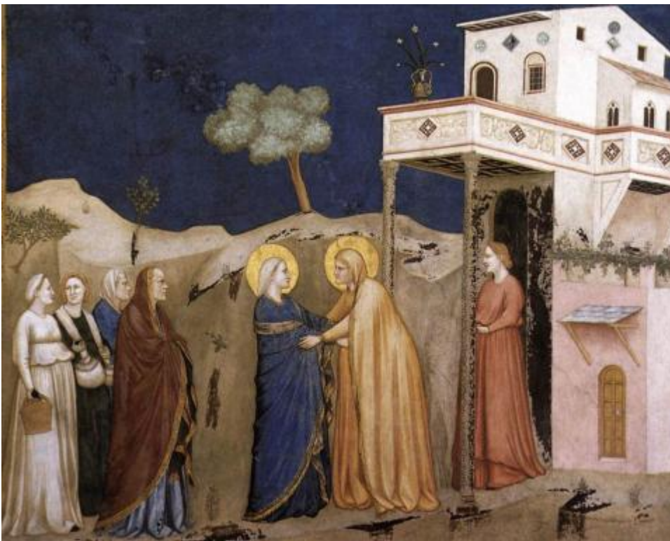
Giotto de Bondone, "The Visitation," circa 1310, Lower Basilica of St. Francis, Assisi

When she speaks of God, her voice breaks, as if he were the ultimate meaning of all her suffering, as if in his name she finds true rest, the doorway to her deepest yearnings for happiness, and the certainty that her children will grow up healthy and happy because love conquers all adversity. It is the humble affliction of the Anawin ,