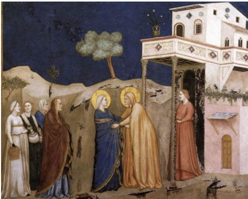
Giotto de Bondone, "The Visitation," circa 1310, Lower Basilica of St. Francis, Assisi

When she speaks of God, her voice breaks, as if he were the ultimate meaning of all her suffering, as if in his name she finds true rest, the doorway to her deepest yearnings for happiness, and the certainty that her children will grow up healthy and happy because love conquers all adversity. It is the humble affliction of the Anawin ,