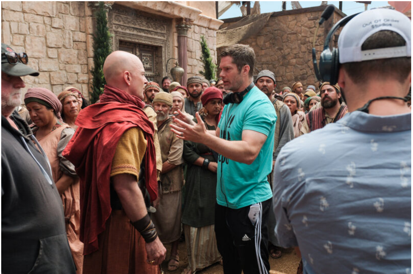
Director Dallas Jenkins, center right, on the set of "The Chosen" during Season Four.

Jenkins said The Chosen LLC and Angel Studios had "different ideas of how to interpret both the contract and what's going to sustain us in our future." Ultimately, he said, the pay-it-forward model that originated with Angel Studios wouldn't allow "The Chosen" to meet its goals of reaching a billion people — including those who can't pay for it — while also financing future seasons, said Jenkins.