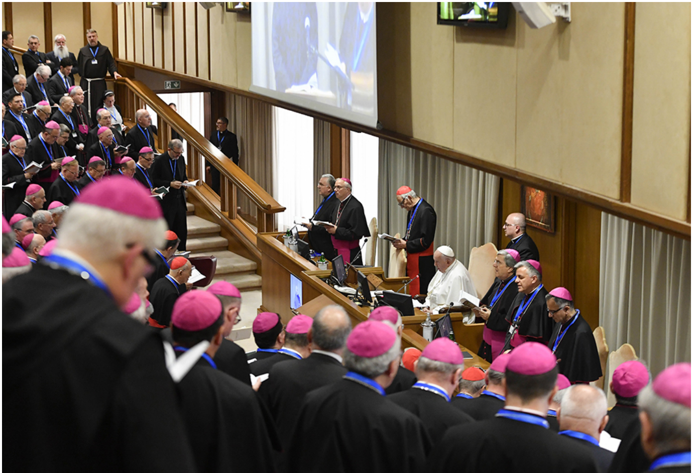
Pope Francis prays with Italian bishops in the Vatican synod hall during the general assembly of the Italian bishops' conference on May 20.

Italian media quoted unnamed bishops who claimed that amid a closed-door meeting with the Italian bishops' conference May 20, the pope, as he strongly reaffirmed the Catholic Church's prohibition on gay men entering seminaries or being ordained priests, jokingly said, "there is already an air of faggotness" in seminaries. After a flurry of news and negative reactions, the Vatican issued an apology May 28.