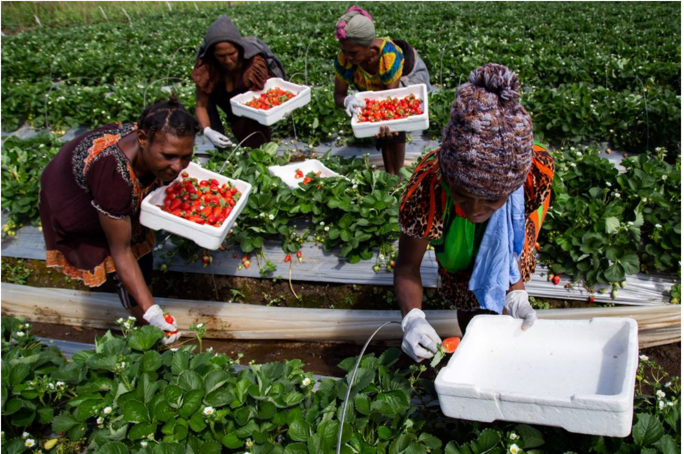
Women pick strawberries in a highland field in Enga Province, Papua New Guinea, in December 2019.

Like their mosquito hosts, Plasmodium parasites are sensitive to temperature . The two most common strains, Plasmodium falciparum and Plasmodium vivax, like temperatures in the range of 56 to 95 degrees Fahrenheit. The warmer the weather, the more quickly the parasites are able to reach their infectious stage. A study that examined temperatures suitable to Plasmodium in the western Himalaya mountains predicted that, by 2040, the mountain range's high-elevation sites — 8,500 feet above sea level — "will have a temperature range conducive for malaria transmission."