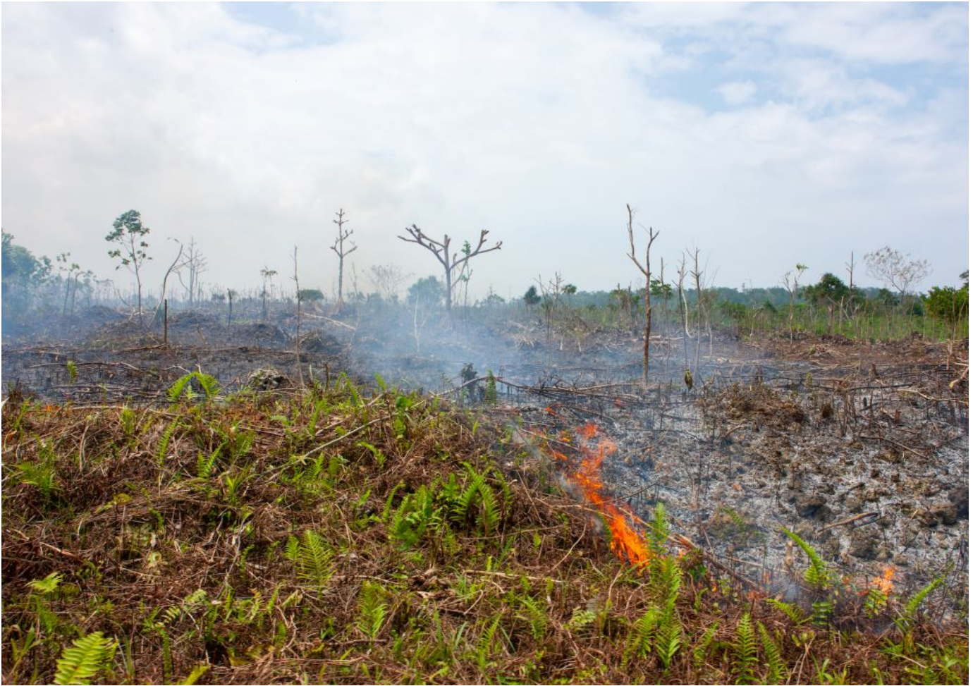
A fire set to repel mosquitoes in Milne Bay Province, Papua New Guinea.

The world's slowly warming highland regions are one small thread in the web of factors influencing the prevalence of malaria. But because of the lack of immunity among populations in upper elevations, the movement of malaria into these zones poses a unique threat to pregnant people — one that may grow to constitute a disproportionate fraction of the overall impact of malaria as climate change continues to worsen.