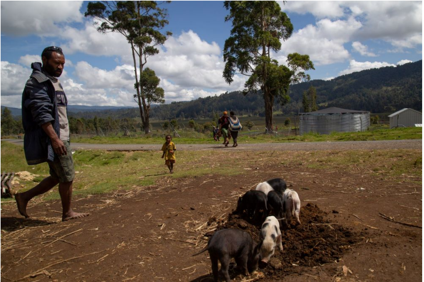
Piglets stand on the road near Kapandas village in the highlands of Papua New Guinea in December 2019.

Silihtau and her colleagues don't have the time or staff to keep close track of how many locally acquired malaria cases have been treated at the hospital over the past year. But Silihtau estimates that when she first started working at the hospital in Goroka two years ago, she saw one case per eight-hour shift, or none at all. Now, she sees between two and three cases of malaria per shift, some of them in individuals who have not traveled outside the boundaries of Papua New Guinea's highland zones.