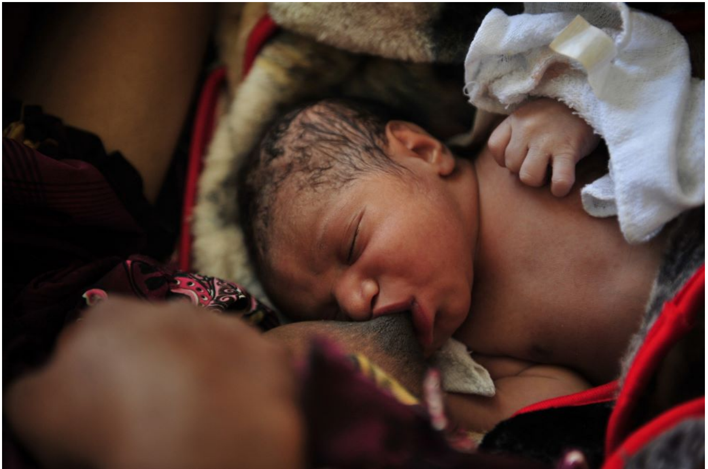
A mother feeds her newborn baby in the maternity ward of a hospital in Goroka in 2009.