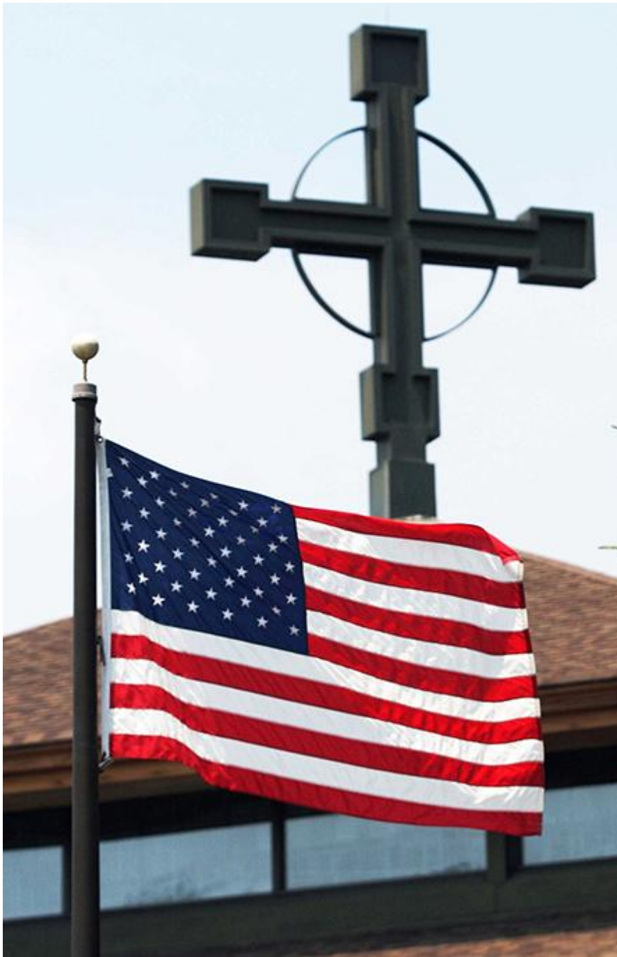
A file photo shows an American flag flying outside a Catholic church in New York.

Then, there is what these groups are doing with all of that money, and this is the important point. Some of these groups are promoting an evangelizing or spiritual message. Some others have plainly partisan goals. In some cases that line is blurry. But in all cases, these groups are penetrating the consciousnesses of U.S. Catholics with much greater effectiveness than any bishop who is burdened not just