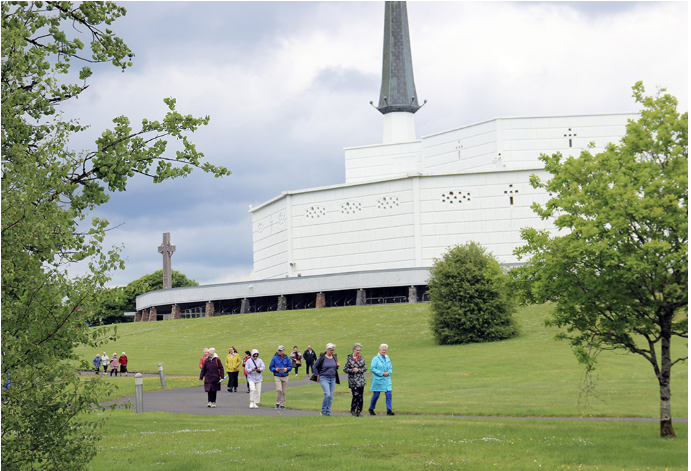
Visitors to Knock Shrine walk through the grounds.