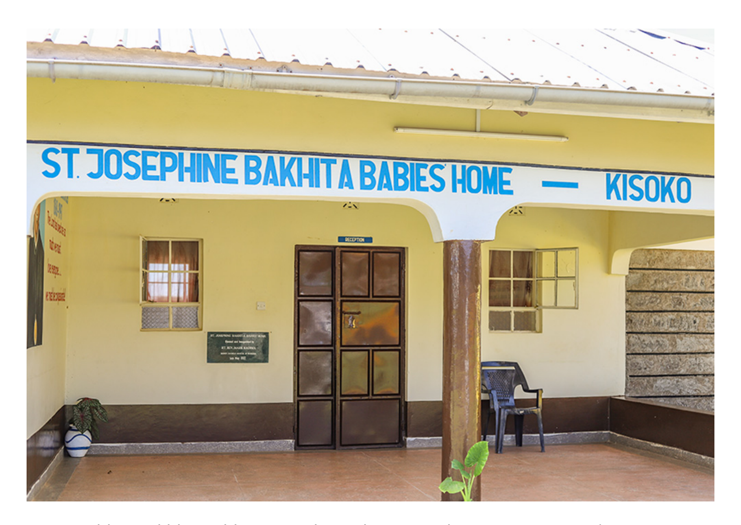
St. Josephine Bakhita Babies Home in Busia, a town in western Kenya.

"I hate my baby and my uncle who made me pregnant," said the former 12th-grade student, revealing that she was suffering in silence and people were laughing at her. "I am not functioning at all, and I keep on dreaming about the incident. I am in deep pain, but there is nothing I can do to recover and find justice."