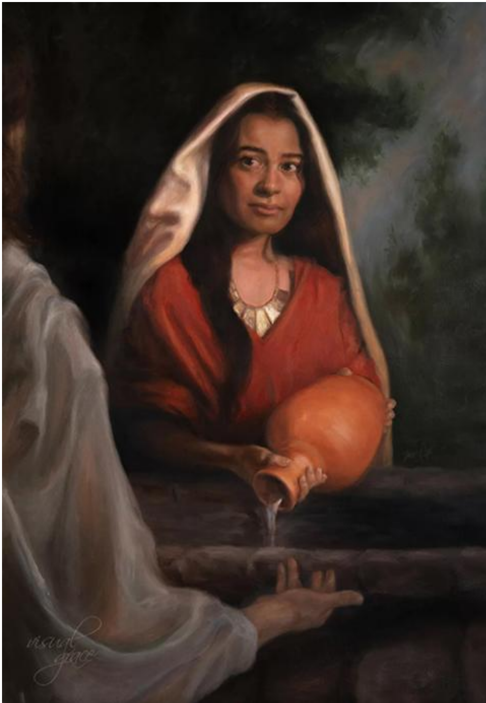
"The Well," an oil painting by Kate Capato, won second place in the show.

The intertwining of beauty and the desire for God radiates from each wall and corner. " Entombment ," by Robert Armetta, earned first place in the show for its evocative portrayal of Christ in the grave that invites the viewer into somber contemplation. Armetta, a master anatomist, created a nearly life-size portrait, approximately 6 feet long and 4 feet high.