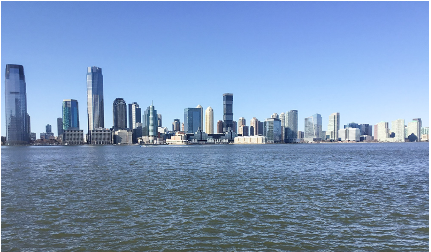
The skyline of Jersey City, New Jersey, is seen from Manhattan, New York.

He sees himself as a combination of traditional and progressive strands of Catholicism. He's recited the rosary with a group of largely older, women parishioners, whom he described as wise elders and faith leaders. Asked to lead the group in prayer, he demurred, for fear he wouldn't remember the rosary formula he learned in his baby boomer Catholic youth.