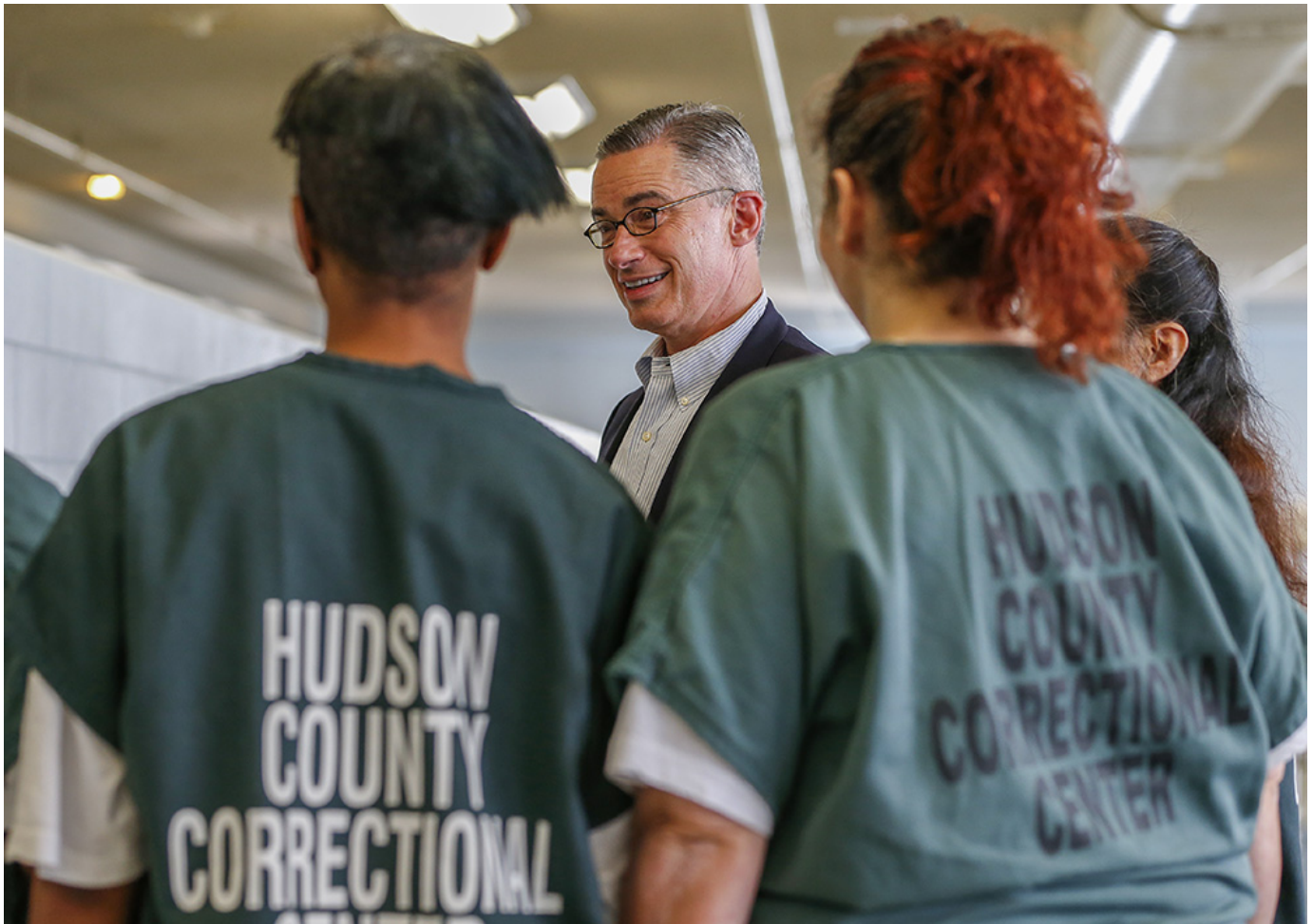
Former New Jersey Gov. Jim McGreevey talks with inmates at Hudson County Correctional Center in Kearny, New Jersey, Aug. 11, 2014.

He's running, he said, to improve the city's public schools, where 90% of the students come from families struggling economically. He wants to build more housing to relieve rising rents in a city of immigrants from Africa, the West Indies and Central America.