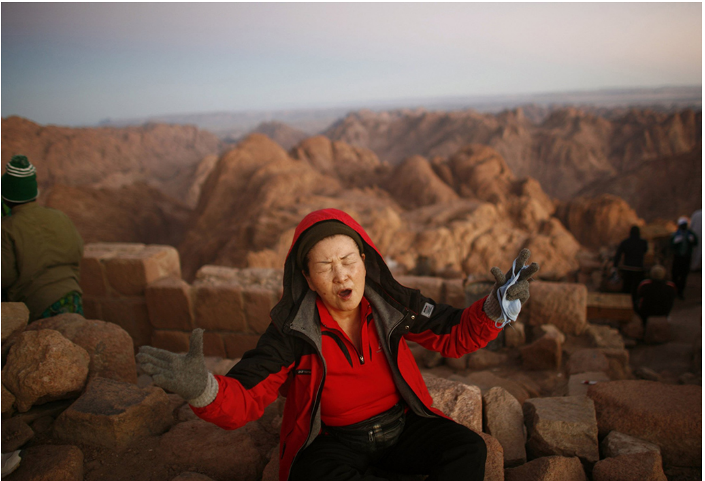
Pictured is a woman praying on Mount Moses in Sinai, Egypt.

Why on Sinai? The land. Pope Benedict XVI, in his book The Spirit of the Liturgy , emphasizes that the full flowering of monotheism did not occur in urban or even cultivated lands, but in the wilderness, "where heaven and earth face each other in stark solitude."