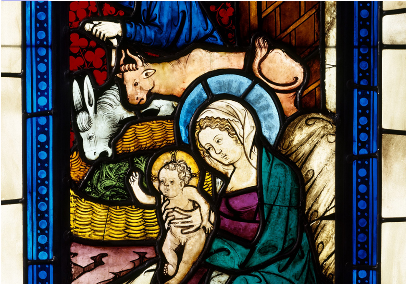
"Adoration of the Magi from Seven Scenes from the Life of Christ," an Austrian glass-stained work circa 1390