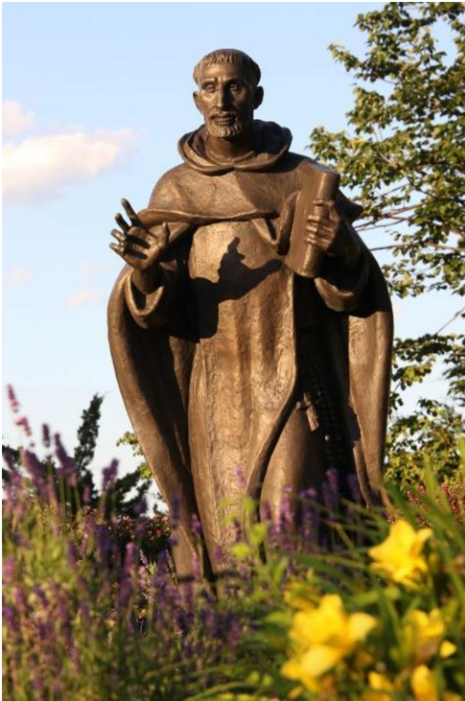
A statue of St. Dominic, who founded the Order of Preachers (the Dominicans) in 1215, stands at the motherhouse of the Sisters of St. Dominic of Amityville, N.Y., in 2017.

"What we Dominicans take away from this is not trying to convince someone of the rightness of my position but to recognize — and this is something that Thomas