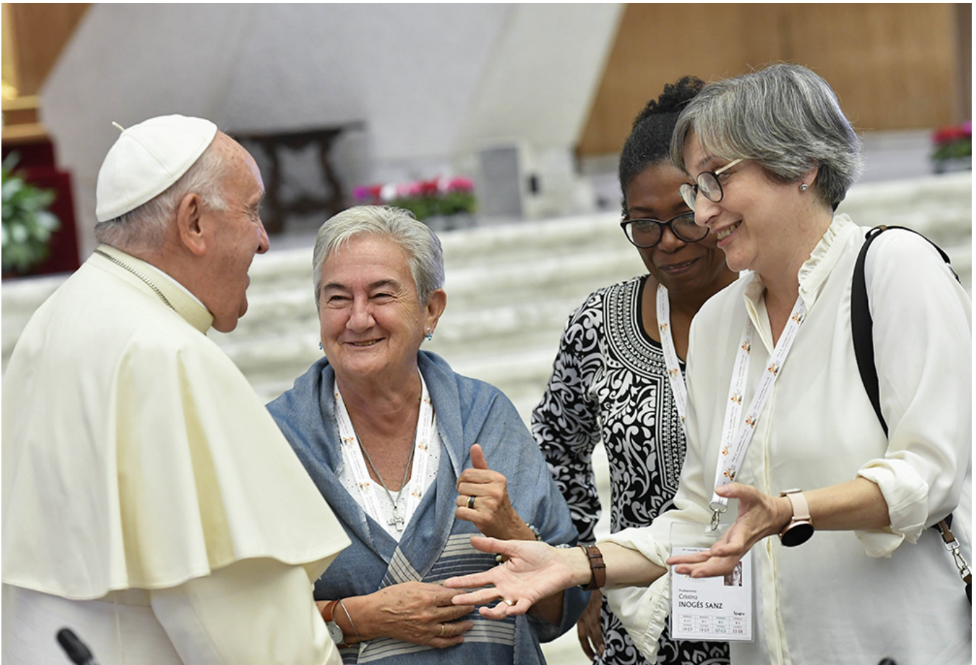
Pope Francis shares a laugh with some of the female members of the assembly of the Synod of Bishops, including Spanish theologian Cristina Inogés Sanz, left, at the assembly's session Oct. 6, 2023, in the Paul VI Audience Hall at the Vatican. Women and laity were voting members of the synod assembly for the first time in 2023.

Throughout the ongoing multiyear synod process, few themes have caused more consternation and discussion than those of the role of women's leadership in the church, the question of how the church might become more welcoming of LGBTQ people and how to form the church's future priests.