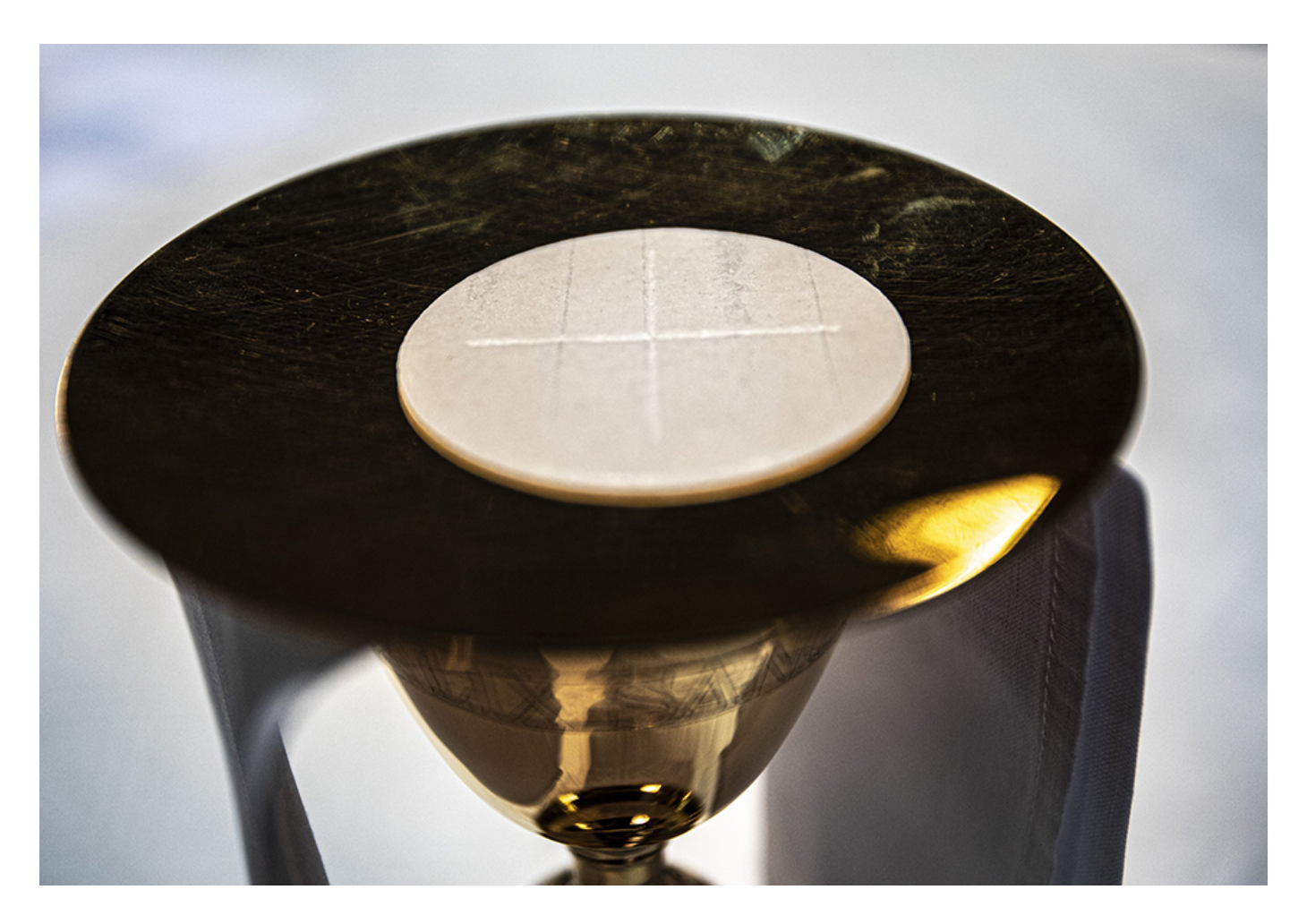
The Eucharist rests on a paten at the altar in the Cathedral of St. Peter in Wilmington, Delaware, on May 27, 2021.