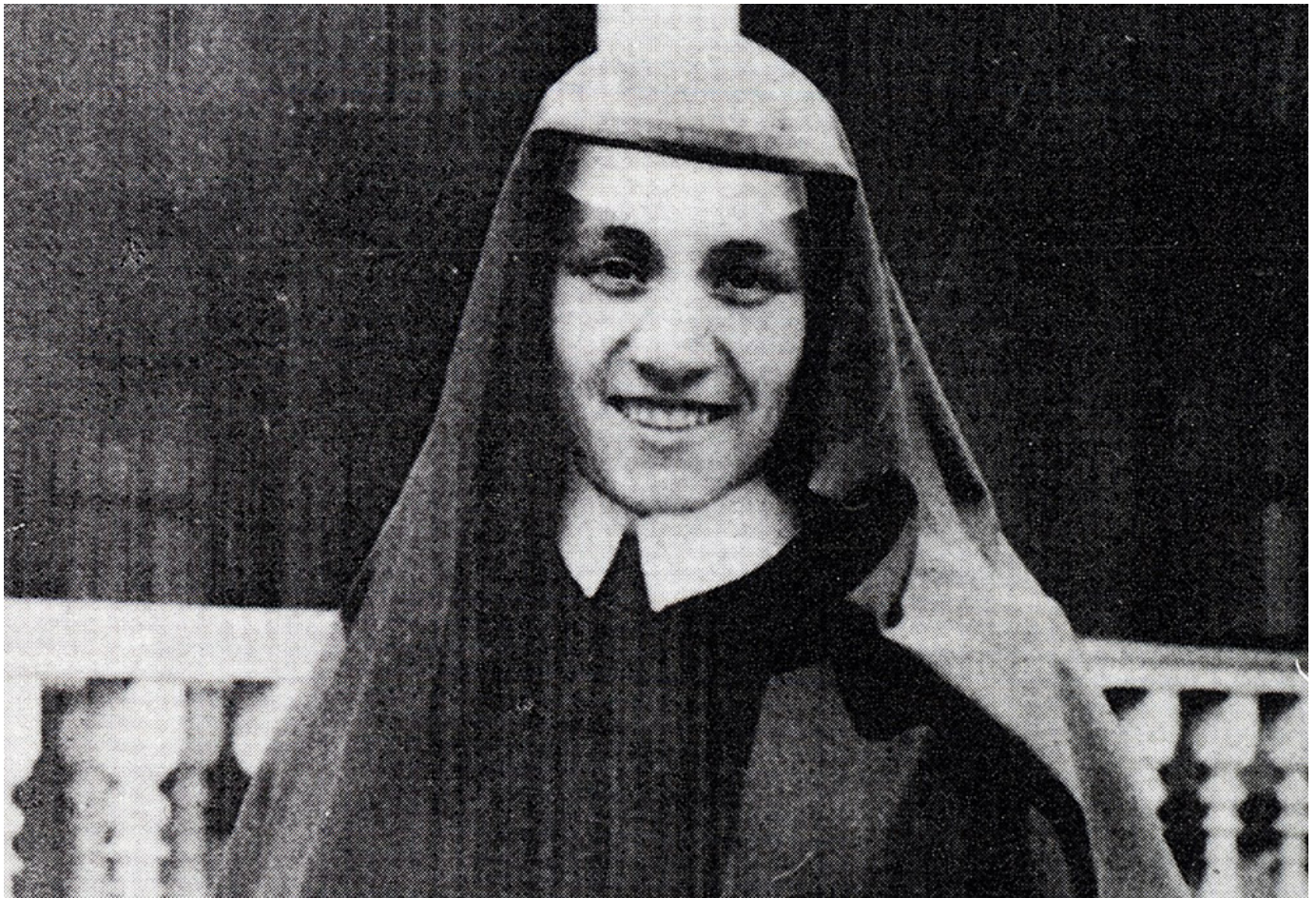
Sister Teresa, later to become Mother Teresa of Calcutta in India, is pictured as a member of the Sisters of Loretto. This photo was taken in the mid-1940s.

After declining his proposal, she offers her definition of helping: