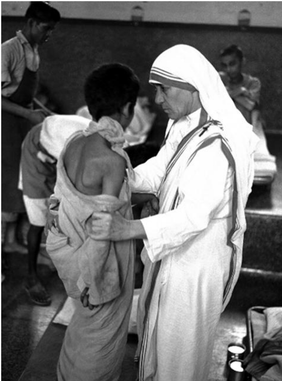
Mother Teresa of Kolkata, who brought smiles to the faces of countless sick and dying people, is pictured with a youth in an undated photo.

This thought invites us to ponder the nature of giving and to strive for contributions that genuinely cost us, embodying the spirit of selflessness shown by Mother Teresa and the Missionaries of Charity. Her selfless giving is a divine example of charisma that highlights a model of charity that emphasizes not just the act of giving but the intent and sacrifice behind it, urging everyone capable to genuinely and