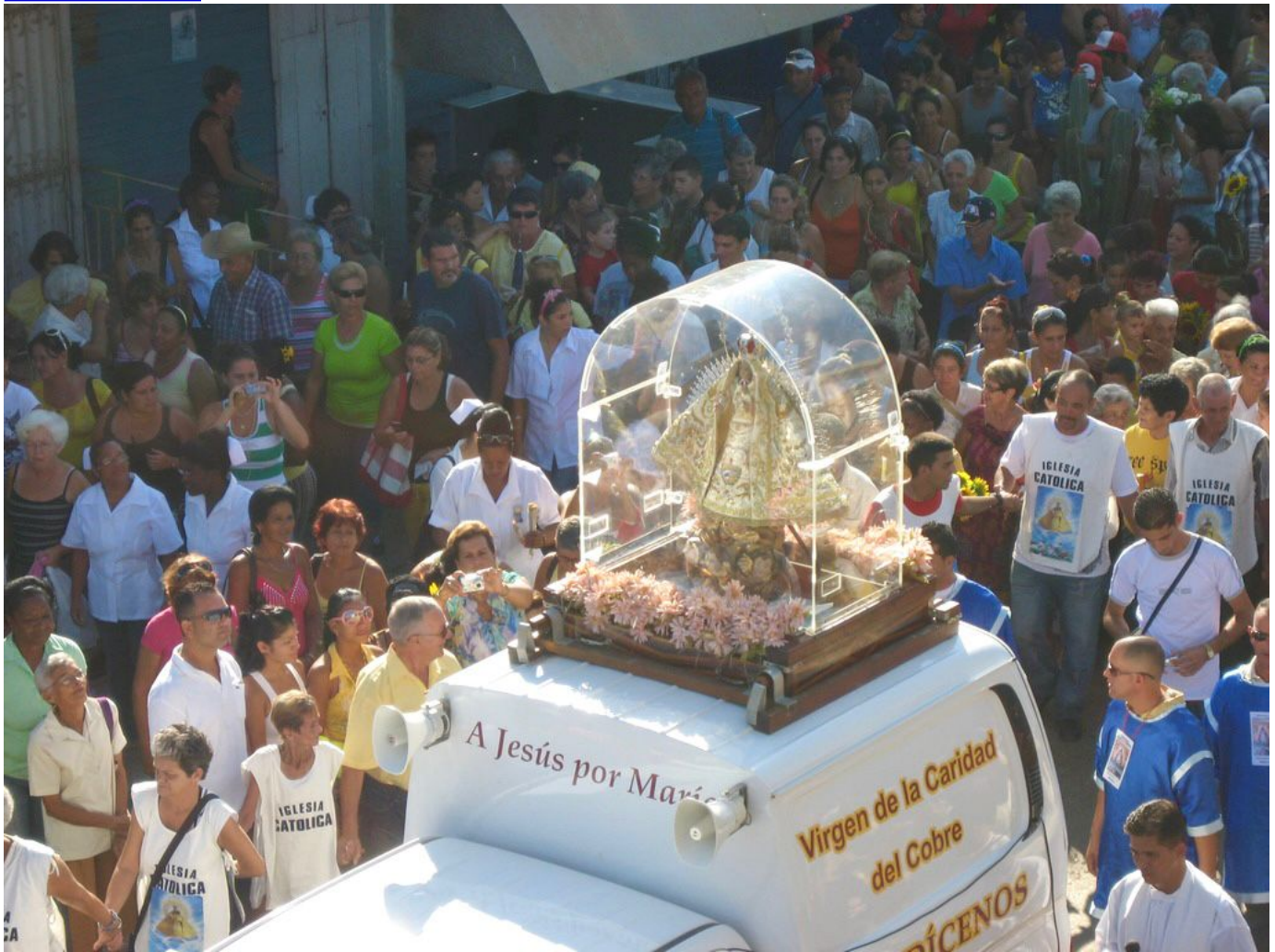
Virgen de la Caridad del Cobre passes through Melena del Sur, Cuba, in 2011.