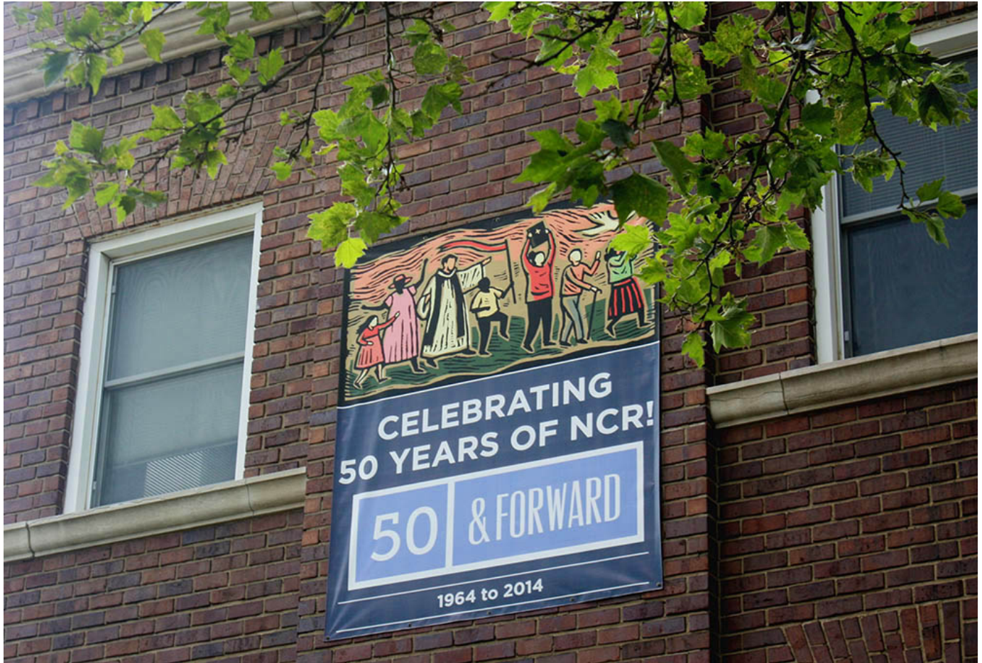
A banner celebrating the National Catholic Reporter's 50th anniversary is seen on the company's headquarters in Kansas City, Missouri.