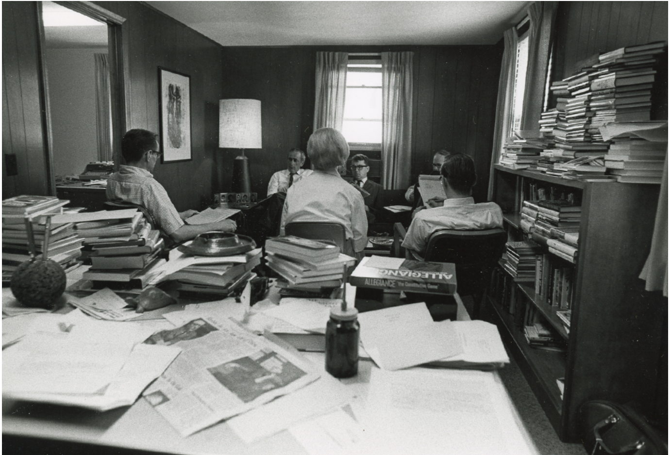
NCR staff are pictured inside the company's headquarters in Kansas City, Missouri, in this 1968 photo. NCR's first issue appeared in October 1964, amid the Second Vatican Council.

Understanding NCR's roots during those times is essential to understanding the fullness of the NCR journalism mission, the commitments of its staff and board of directors, and the power behind its endurance for nearly six decades now.