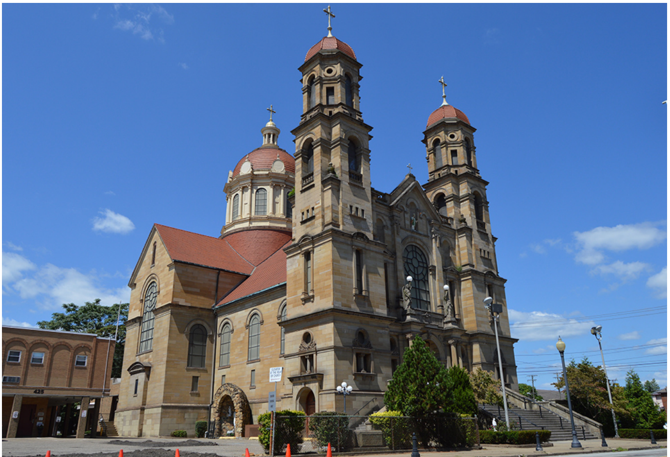
St. Peter Catholic Church in Steubenville, Ohio, is pictured in an Aug. 22 photo.