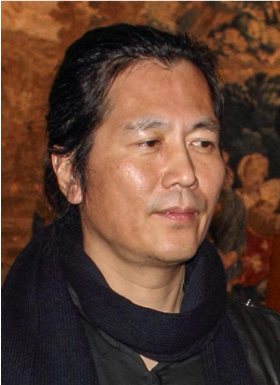
Byung-chul Han, author of The Crisis of Narration

There might be something worth exploring in each of these arguments, but Han eschews evidence and nuance in favor of superficial clichés. Nowhere is this more evident than his blithe assertion that humans have transformed from homo sapiens into " phono sapiens ." His arguments are only slightly more polished versions of underinformed technophobia.