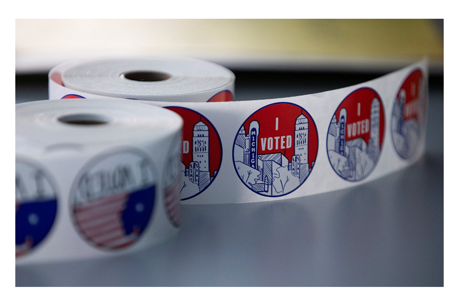
Michigan "I Voted" stickers are seen in Ann Arbor in 2020.