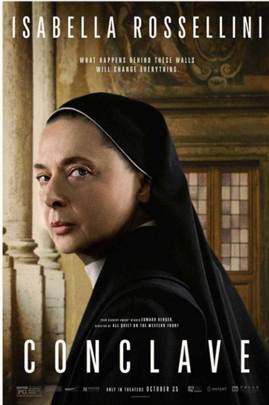
Isabella Rossellini stars in "Conclave."

Rossellini: I loved Lawrence's speech about doubt. Whether it's society or the church, we forget that we're humans, prone to make mistakes due to our limited understanding. The film reminds you of that. I like that the film ends with a big question mark in many ways. The pope that is selected is not the one people expected, but he is the one who has dedicated his life to the poor and needy.