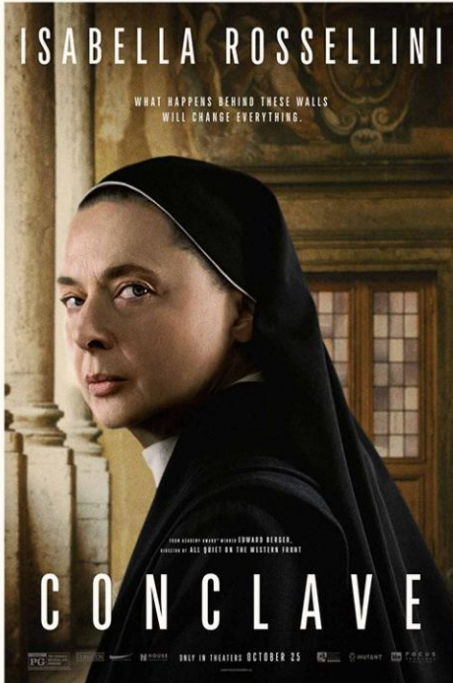
Isabella Rossellini stars in "Conclave."

Rossellini: I loved Lawrence's speech about doubt. Whether it's society or the church, we forget that we're humans, prone to make mistakes due to our limited understanding. The film reminds you of that. I like that the film ends with a big question mark in many ways. The pope that is selected is not the one people expected, but he is the one who has dedicated his life to the poor and needy.