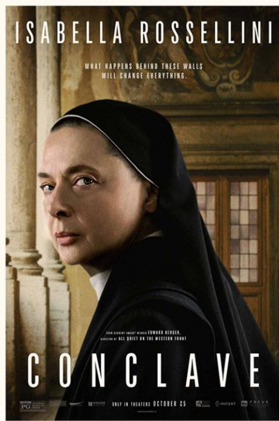
Isabella Rossellini stars in "Conclave."

Rossellini: I loved Lawrence's speech about doubt. Whether it's society or the church, we forget that we're humans, prone to make mistakes due to our limited understanding. The film reminds you of that. I like that the film ends with a big question mark in many ways. The pope that is selected is not the one people expected, but he is the one who has dedicated his life to the poor and needy.