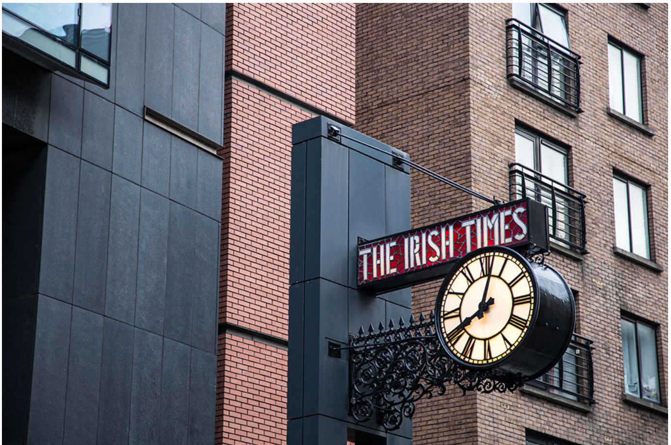
The head office of The Irish Times newspaper in Dublin

Questions trailed him through college into the reporting work, which evinces serious heart in his coverage of the abuse crisis, searching out nuances of predators and survivors.