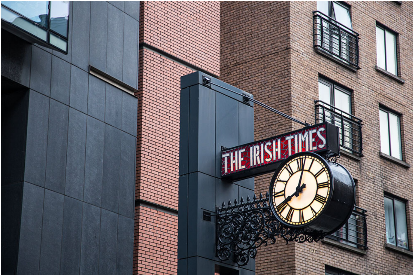
The head office of The Irish Times newspaper in Dublin

Questions trailed him through college into the reporting work, which evinces serious heart in his coverage of the abuse crisis, searching out nuances of predators and survivors.