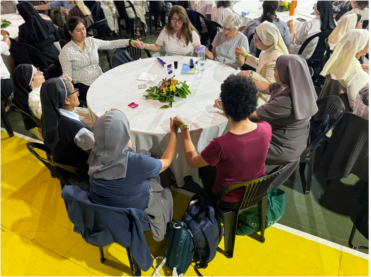
A group of women and men religious pray in Córdoba, Argentina, during the opening Mass of the V Latin American and Caribbean Congress on Religious Life, organized by CLAR Nov. 22-24, 2024, in Córdoba, Argentina.