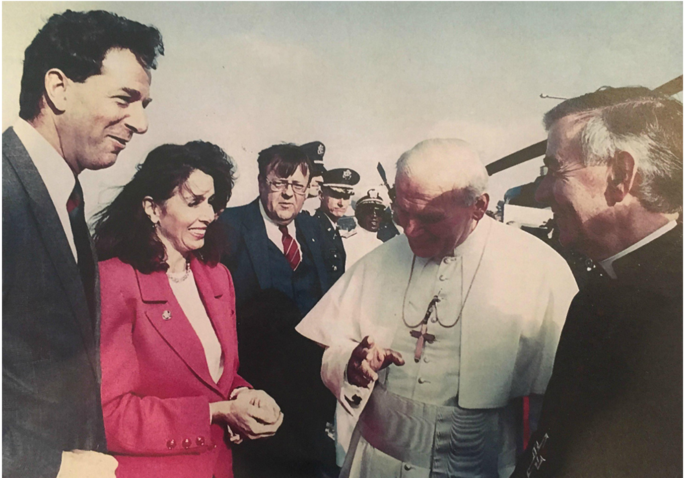
Former House Speaker Nancy Pelosi and her husband Paul greet Pope John Paul II during his visit to San Francisco, in September 1987.

The San Francisco Democrat also discussed the emotional toll the incident took on her family and her reliance on faith.