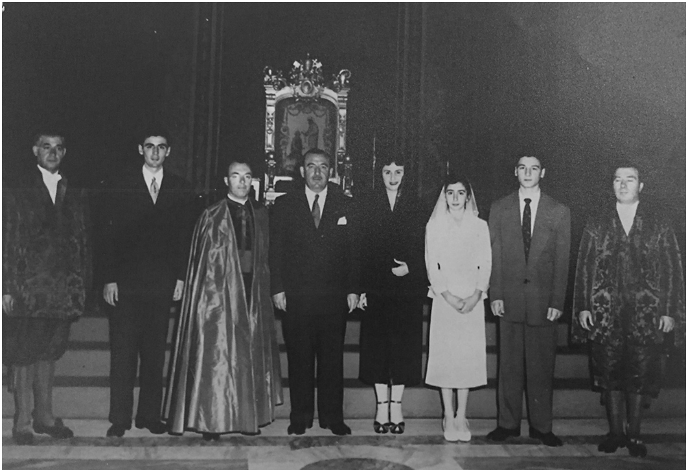
Former House Speaker Nancy Pelosi (in white dress) with her family during a visit at the Vatican in 1954.

Then, she paused, closed her eyes and quoted the Gospel of Matthew. " 'When I was hungry, you fed me. When I was naked, you clothed me. When I was homeless, you sheltered me. When I was a stranger, you welcomed me. When I was in prison, you visited me' â?? except right now," she said.