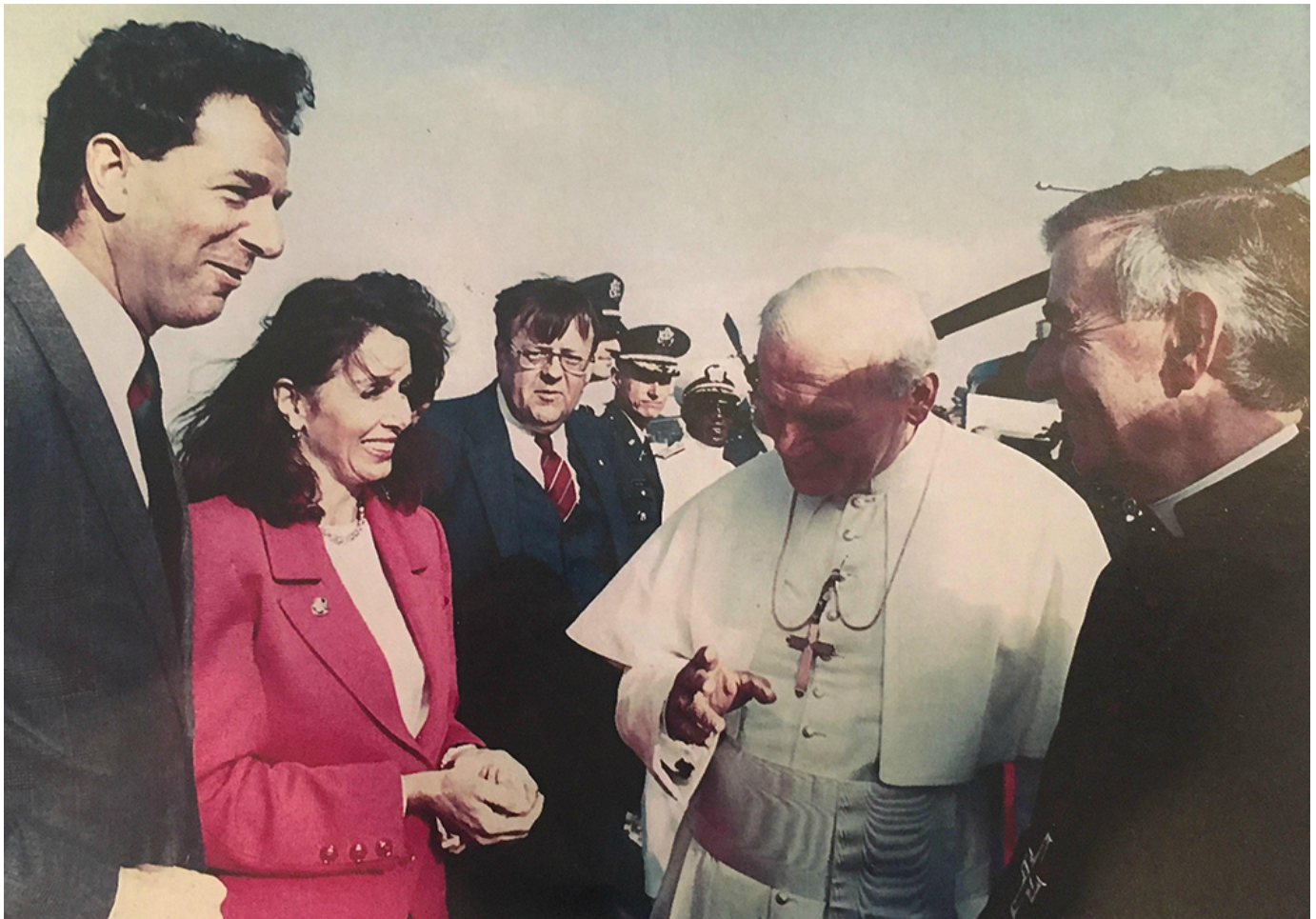
Former House Speaker Nancy Pelosi and her husband Paul greet Pope John Paul II during his visit to San Francisco, in September 1987.

The San Francisco Democrat also discussed the emotional toll the incident took on her family and her reliance on faith.