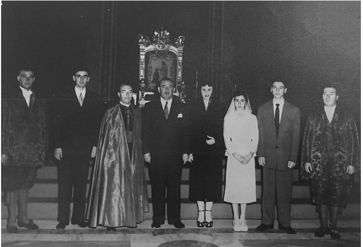
Former House Speaker Nancy Pelosi (in white dress) with her family during a visit at the Vatican in 1954.

Then, she paused, closed her eyes and quoted the Gospel of Matthew. " 'When I was hungry, you fed me. When I was naked, you clothed me. When I was homeless, you sheltered me. When I was a stranger, you welcomed me. When I was in prison, you visited me' — except right now," she said.