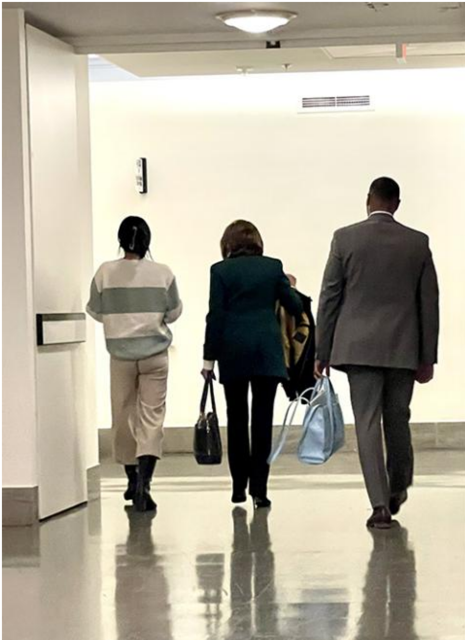
Former House Speaker Nancy Pelosi walks to her California representative's office on Capitol Hill, Dec. 6.

In contrast to the bishops' opposition to the health care law, more than 50,000 Catholic nuns signed a petition supporting the ACA, Pelosi noted. "The nuns were very important — not just for the votes, but for the substance," she said.