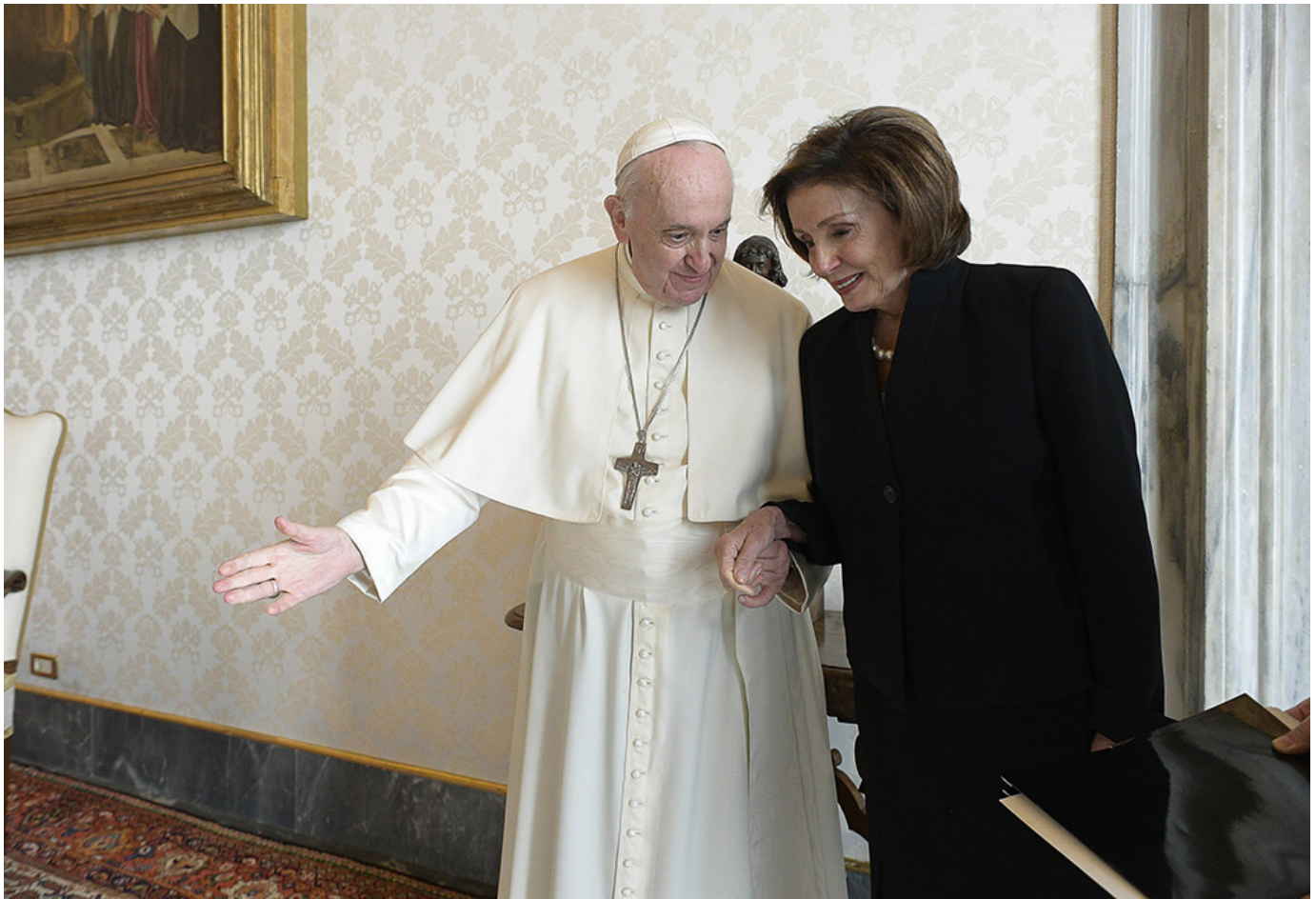
Pope Francis greets then-U.S. House Speaker Nancy Pelosi, D-Calif., during a private audience Oct. 9, 2021, at the Vatican.

At the same time, her criticism is unsurprising given her personal faith and longstanding criticism of China's human rights record. Pelosi, who angered China in 2022 with a trip to Taiwan as one of her last acts as speaker, noted that Republicans and Democrats both joined her objection over Sino-Holy See relations. Pelosi said she was so troubled with the Vatican's agreement that she took her complaints to the papal nuncio, the Vatican's ambassador in the United States.