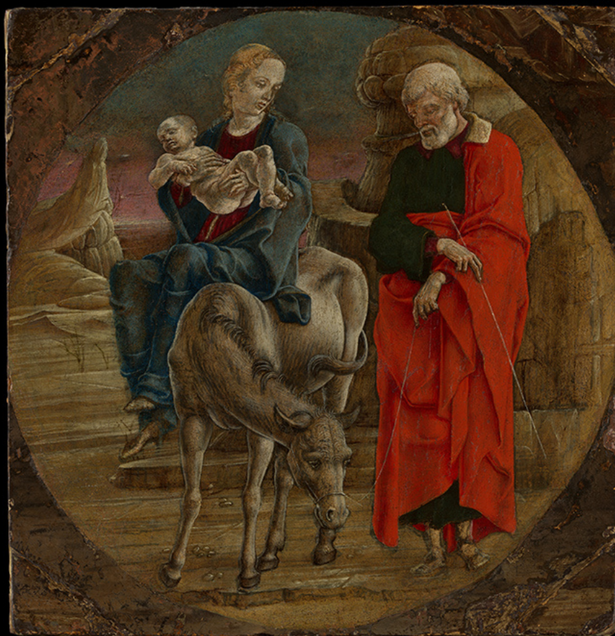
"The Flight into Egypt," circa 1470s painting by Cosmè Tura (Metropolitan Museum of Art)