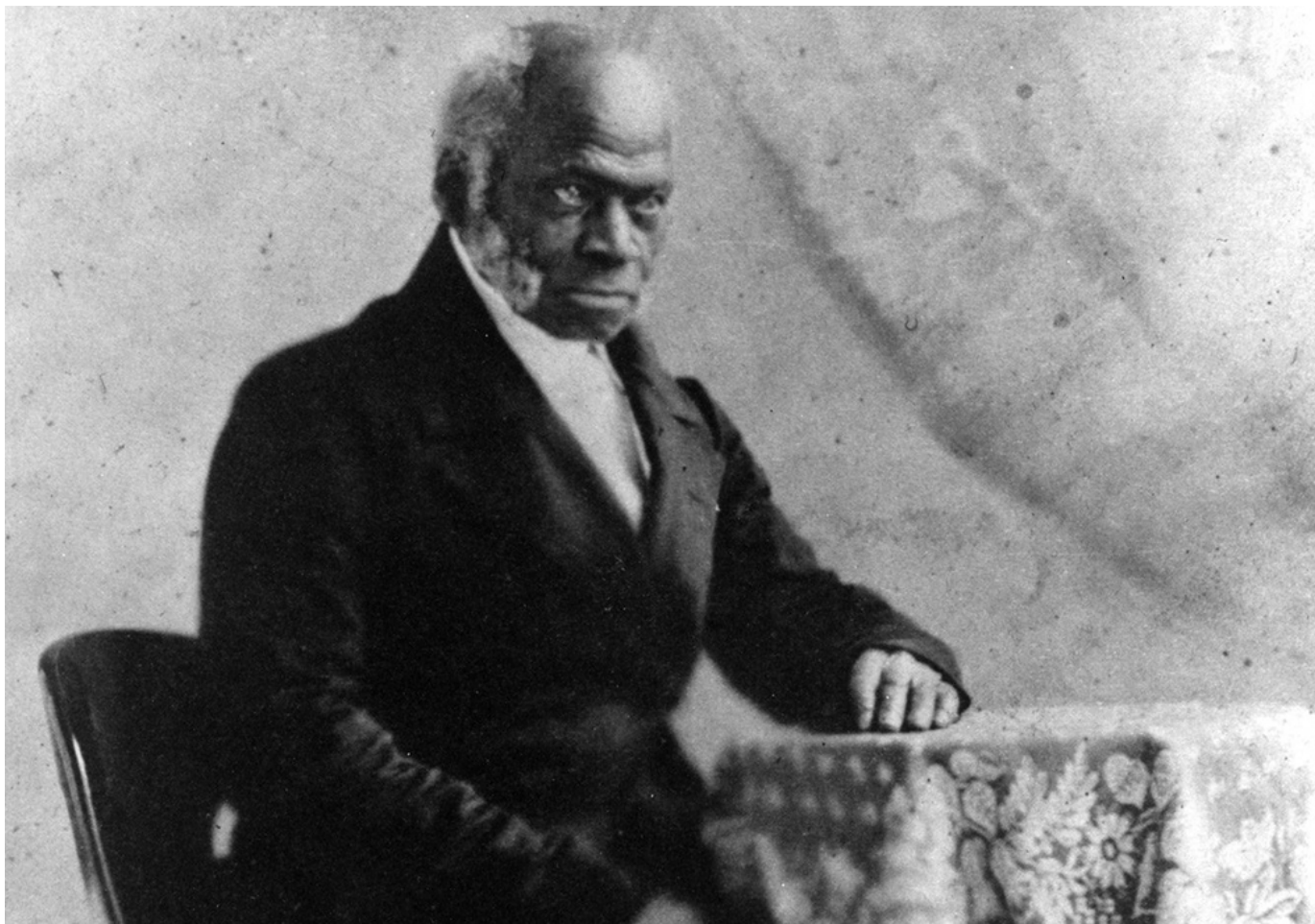
Pierre Toussaint, who was declared venerable in 1997, is pictured in an undated file photo. Toussaint died June 30, 1853, at age 87.

Pierre Toussaint was born enslaved in Haiti and was freed in 1807 after his owners moved to New York City. He later prospered as a hairdresser in the city and used his funds to purchase the freedom of both his sister and future wife. He was known across New York City for his many acts of charity on behalf of the poor. Not content with a life of daily Mass attendance, Toussaint spent hours in service to the sick and outcast of the city. When he died in 1853, the streets filled with those impacted by his ministry. Toussaint is the only layman to be buried in the crypt at St. Patrick's Cathedral.