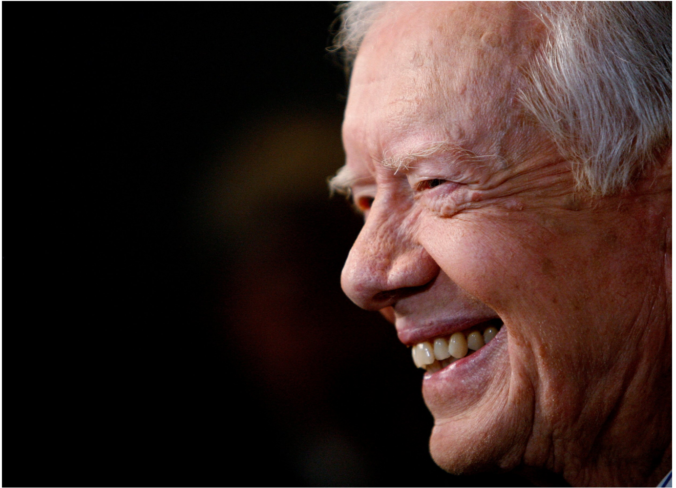
Former U.S. President Jimmy Carter smiles at the premiere of "Jimmy Carter: Man From Plains" at the Elgin theatre during the 32nd Toronto International Film Festival in Toronto, Canada, Sept. 10, 2007. Carter died Dec. 29, 2024, at 100, at his home in Plains, Georgia.