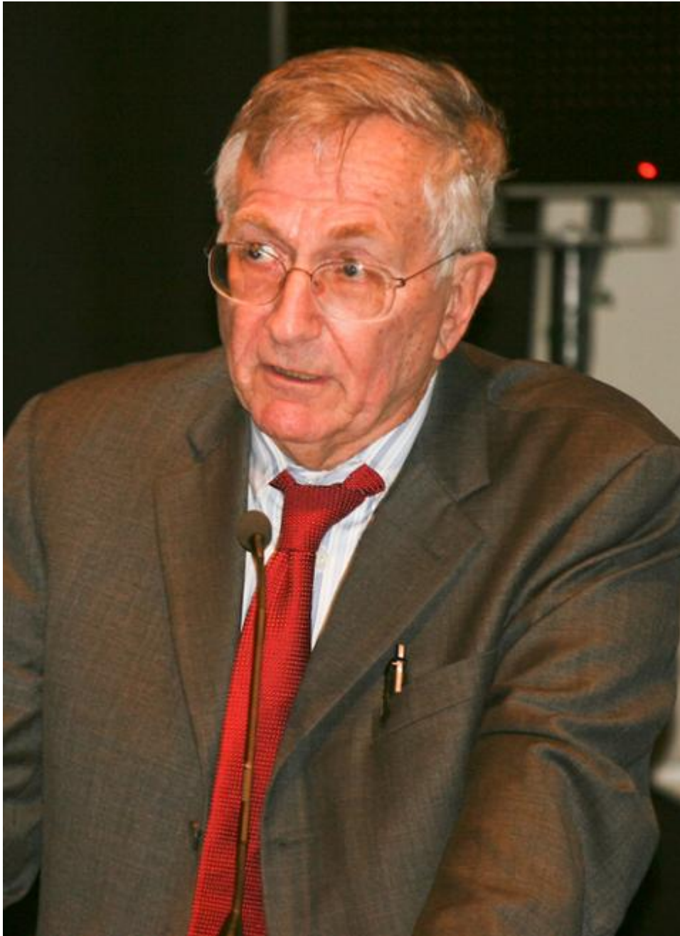
Seymour Hersh, pictured in a 2009 photo

"Hoyt had reached out to me," Hersh wrote, "and offered to publish anything I wished."