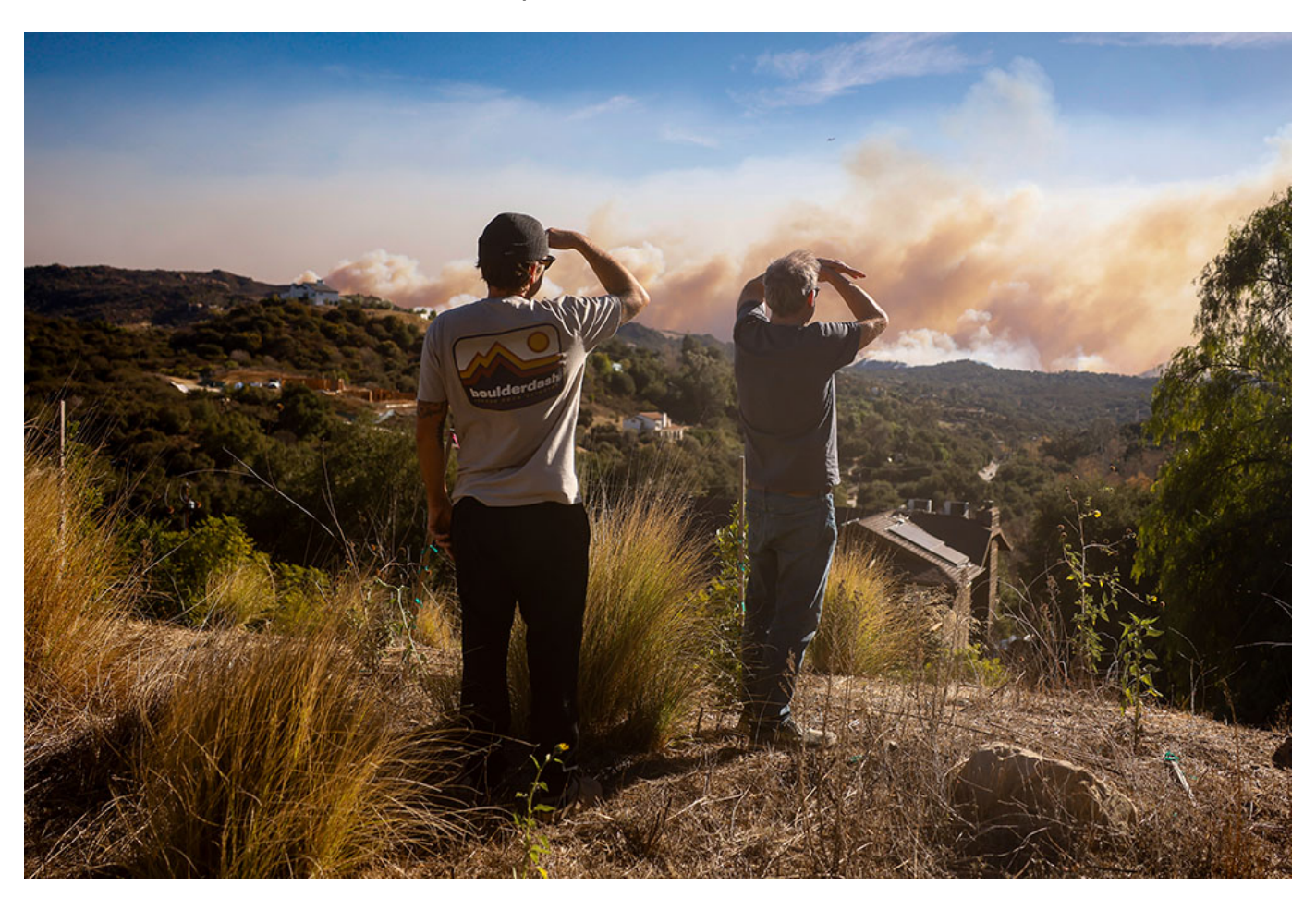
Topanga Canyon inhabitants look on as the Palisades Fire burns in the hills between Pacific Palisades and Malibu Jan. 8, 2025, in Topanga, California.

When we eventually caught up for a longer conversation, he said, "For me the fires have been surreal, reminding me of Katrina, where my family was affected. ... Back in 2005, I threw a fundraising concert to help my family and others in New Orleans. The winds here have been 100 mph this week, like a hurricane."