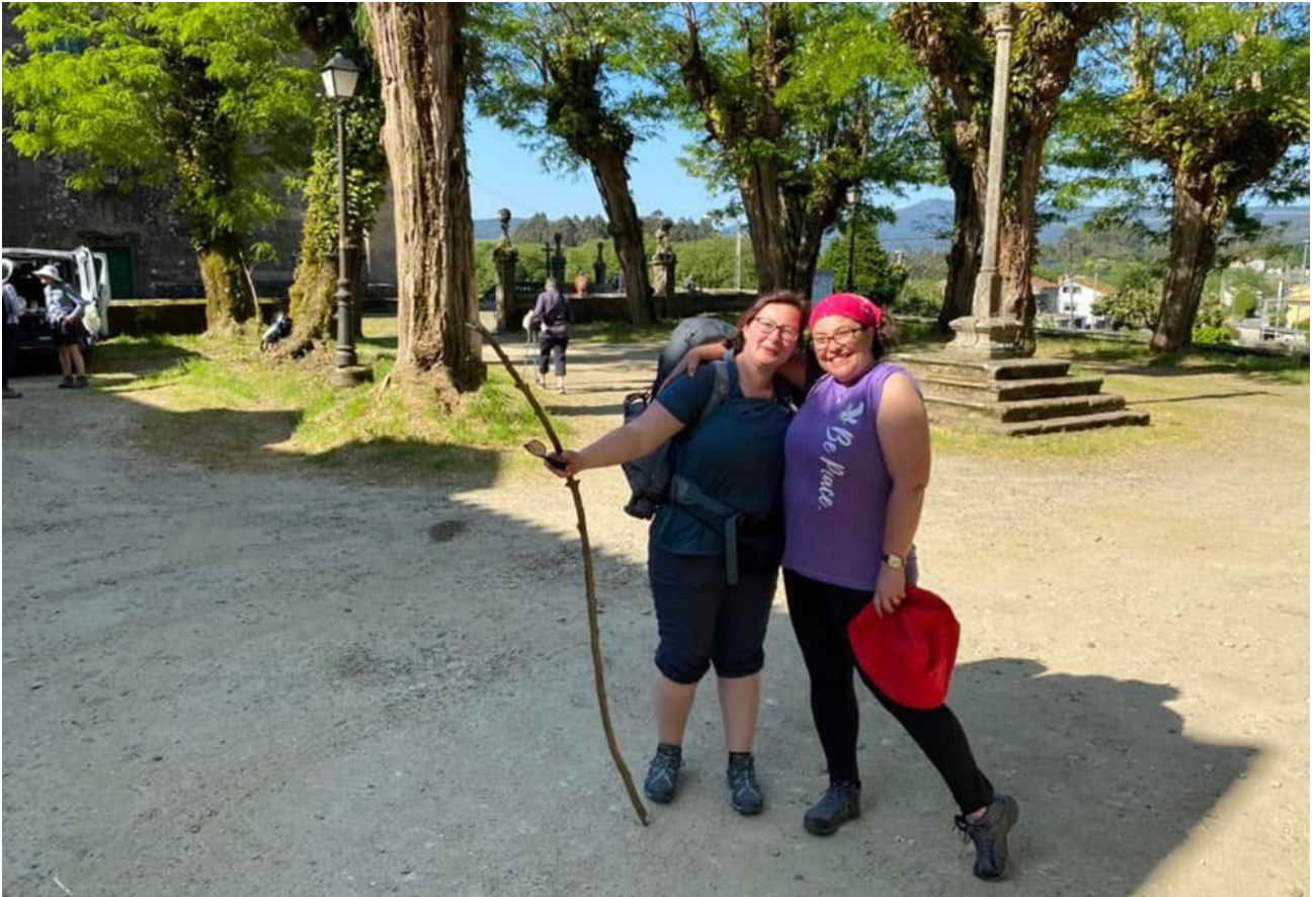
Pilgrims walk together along the road to Santiago de Compostela.

As we walk together in faith, we do so with the awareness that we follow in the footsteps of many generations before us and hold in prayer those who will come after us. Our pilgrimage will lead us through diverse landscapes and bring us into communion with fellow travelers who will share in our joys, struggles and surprises. In this communal journey, I am challenged to walk with my faith community — not rushing, but allowing the Holy Spirit to guide us, ever attentive to God's presence.