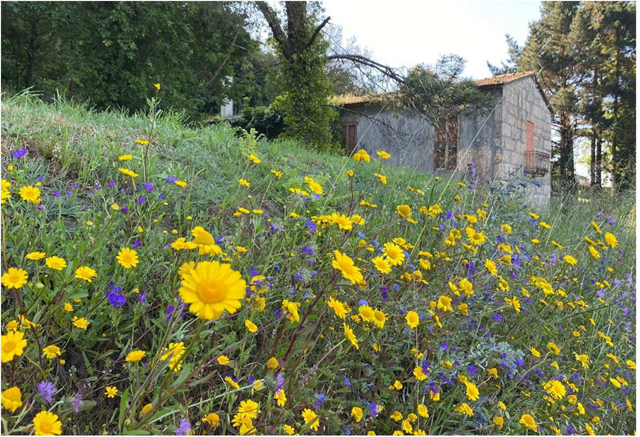
Scenic views along the pilgrimage route to Santiago de Compostela