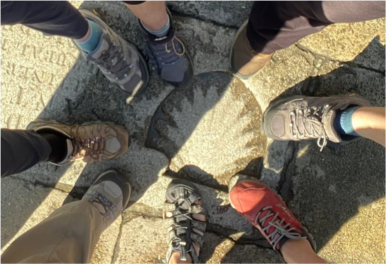
Pilgrims reach the end of their journey at Santiago de Compostela.