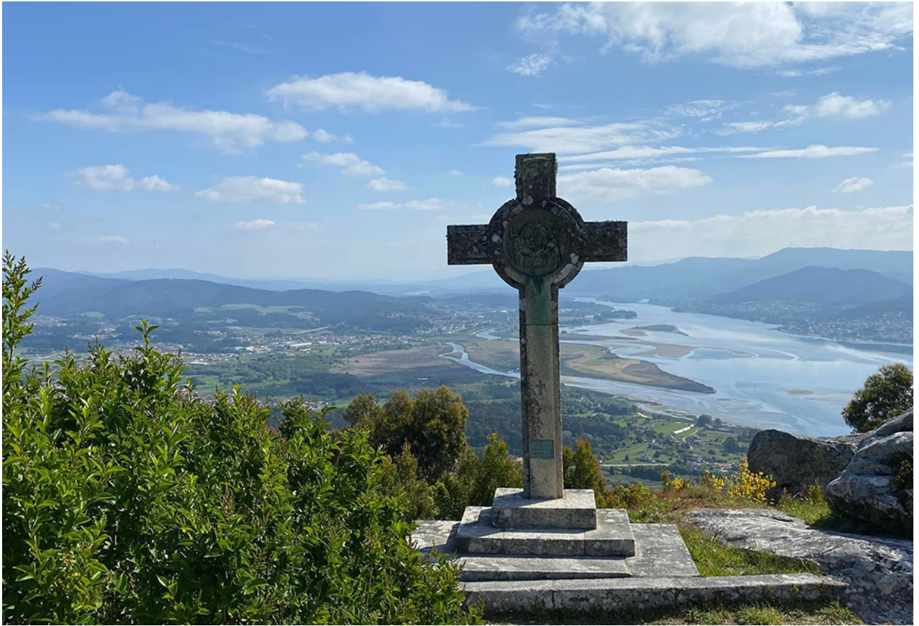
Scenic views along the pilgrimage route to Santiago de Compostela