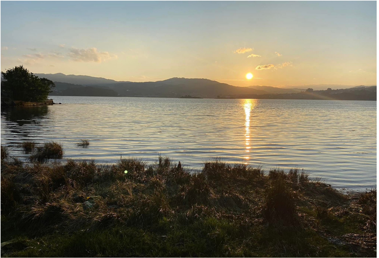
Scenic views along the pilgrimage route to Santiago de Compostela