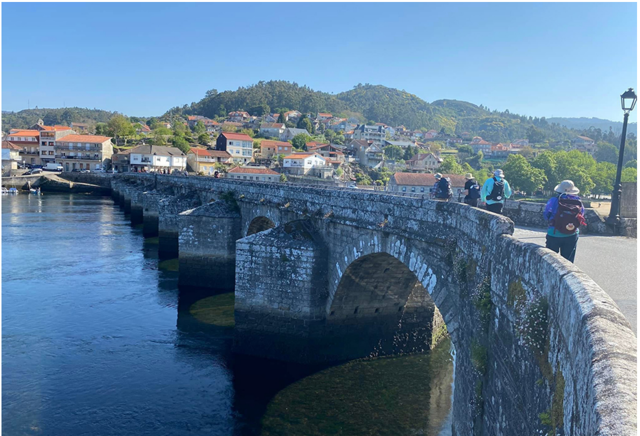
Scenic views along the pilgrimage route to Santiago de Compostela

I hold my pilgrim experience in my heart as a powerful lesson in the beauty of the journey. My pilgrimage began in 2011 as I discerned religious life. In 2021, I walked as a peregrina . Now, in 2025, I embrace the call to be a "Pilgrim of Hope" with my church. My hope for this Jubilee Year is that we, as a faith community, remain open to the wild and exciting journey where the Holy Spirit leads.