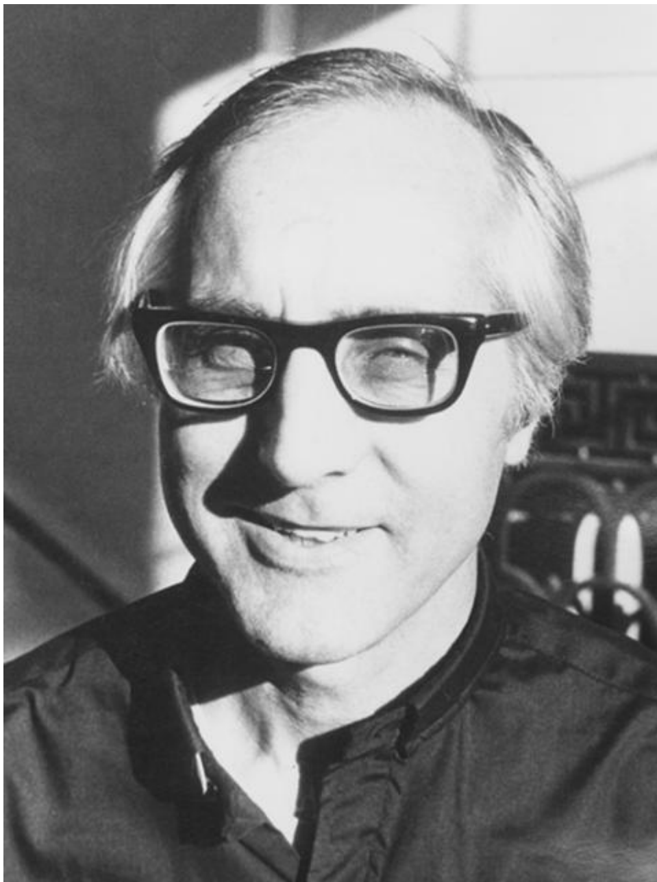
Detroit Auxiliary Bishop Thomas Gumbleton in 1979

The bishops, USCC staff were quick to note, cannot go back on their positions. This will mean the USCC and other Washington religious groups with similar views may find themselves being among the few powerful organizations looking after the interests of the poor and the powerless in this country and elsewhere in a time of budget cuts and tax cuts in domestic policy; and military jingoism in foreign affairs.