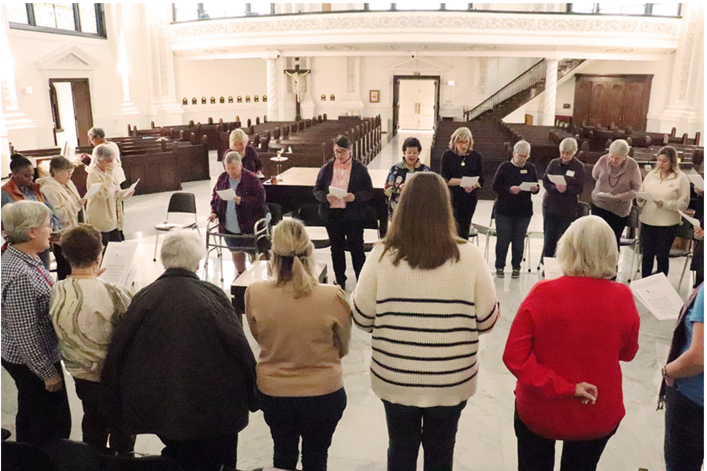
Associates of the Ursuline Sisters of Louisville pray in the congregation's chapel at an associates meeting in February 2024.