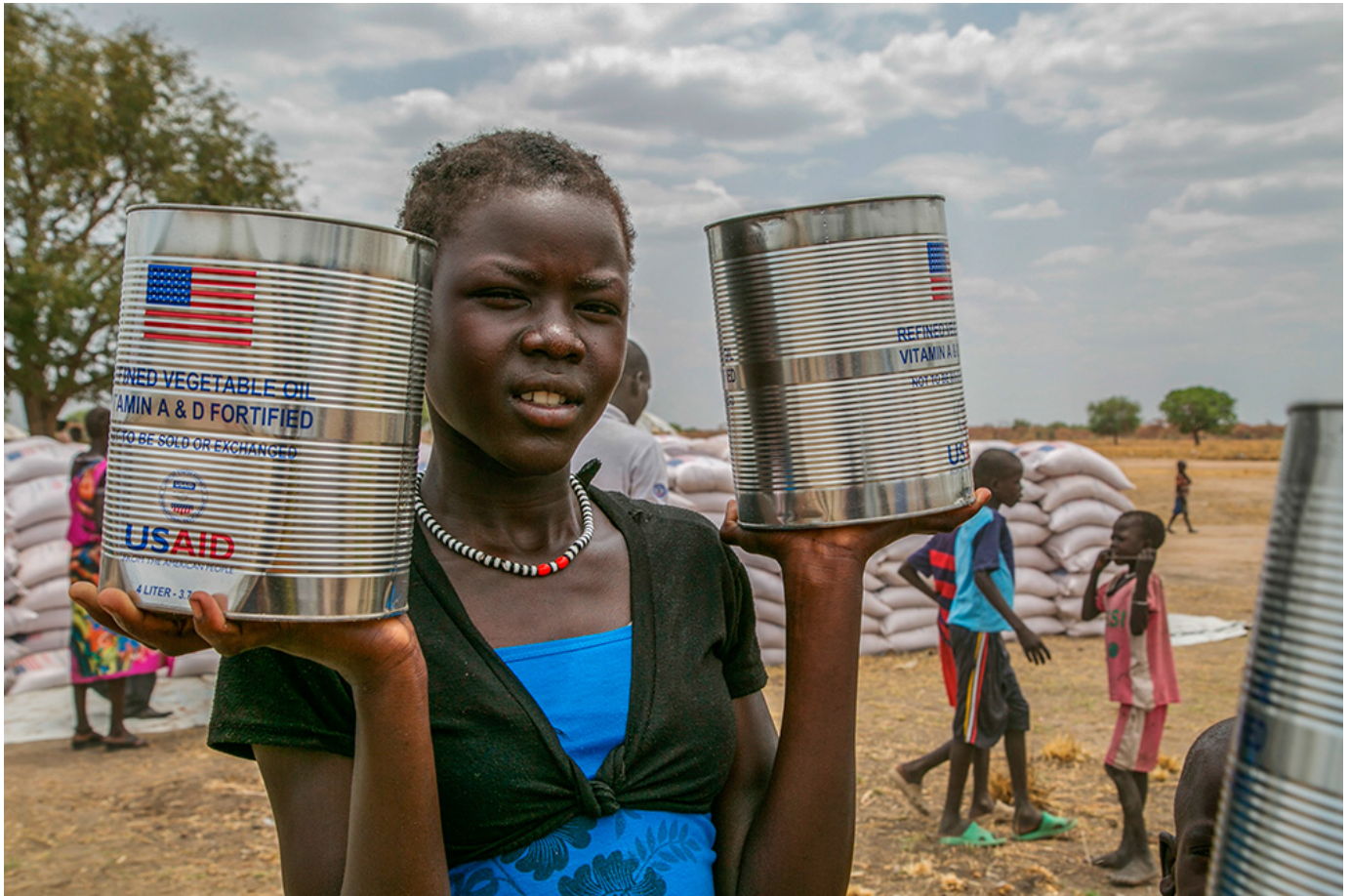
A woman holds cans of vegetable oil provided by the U.S. Agency for International Development in Pajut, South Sudan in 2017.

from other countries or organizations, to fill the gap left by the U.S. However, local governments and NGOs might lack the capacity to fully address the needs such as health care and food security by vulnerable populations, leading to longer-term setbacks in development," Banda said.