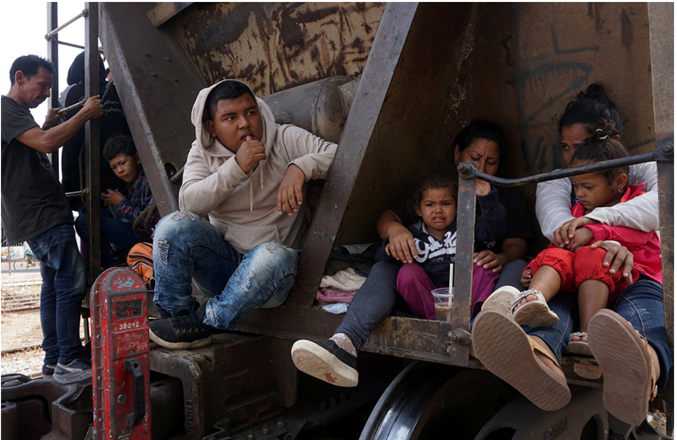
Central American migrants, moving in a caravan through Juchitan, Mexico, are pictured in a file photo on a train during their journey toward the United States.

Because migration is not just movement — it is exchange. Those who leave their homelands often send back more than memory; they send billions in remittances, sustaining families, communities and entire economies. In the U.S., immigrants contribute far beyond what they take, paying into tax systems, bolstering social security, and filling labor shortages that would otherwise fracture industries. But the impact of migration is not just economic. It is cultural, spiritual. It is a sharing of stories, traditions, a theology of survival and resilience. Immigrants remind us that the church is not bound by borders but by the hospitality of God. In them, we do not find mere laborers or taxpayers — we find teachers, healers, entrepreneurs and prophets.