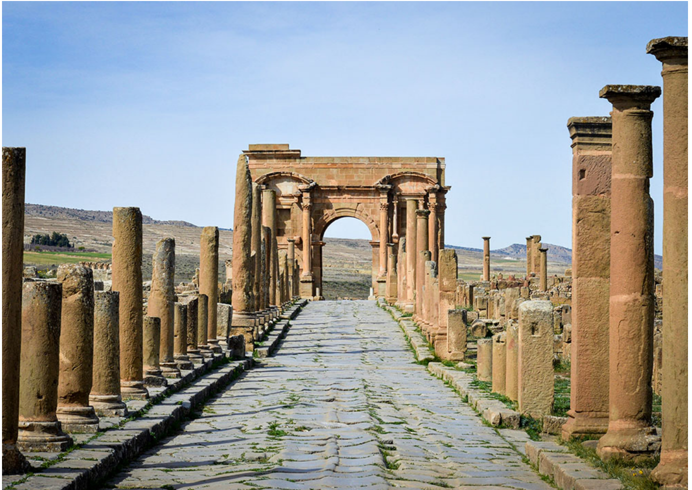
Ruins of the Roman Empire in the province of Batna, Algeria