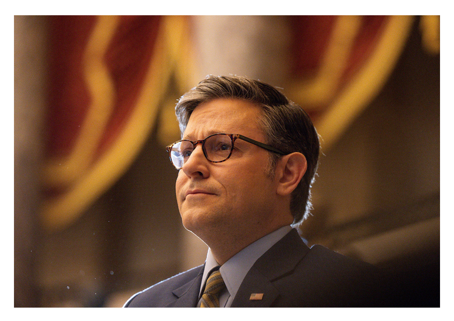
U.S. House Speaker Mike Johnson, R-La., listens to the national anthem during a ceremony in Washington on Dec. 10, 2024.

Those who lost coverage in Arkansas said they were forced to delay care or skip medications due to cost, or they incurred sizable <u>medical debt</u>, according to one analysis. Most significantly, the employment rate for the target population <u>did not increase</u>.