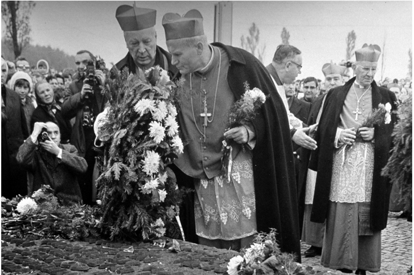
Cardinal Stefan Wyszynski of Warsaw and Cardinal Karol Wojtyla of Krakow, the future Pope John Paul II, and Cardinal John Krol of Philadelphia are pictured at a ceremony in Brzezinka, Poland, Oct. 15, 1972.

Many inaccurate reports have circulated that he was appointed cardinal to counterbalance the influence of Cardinal Stefan Wyszynski, primate of Poland. Wojtyla is 20 years younger than Wyszynski, does not share his anti- intellectual approach and does not reduce theology to Mariology, but they have remained friends, and Wojtyla has always remained perfectly loyal to Wyszynski. The unity of the Polish episcopate is the basis of their entire policy.