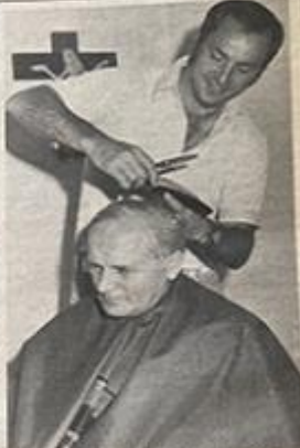
Haircut at Orchard Lake, Mich., seminary.