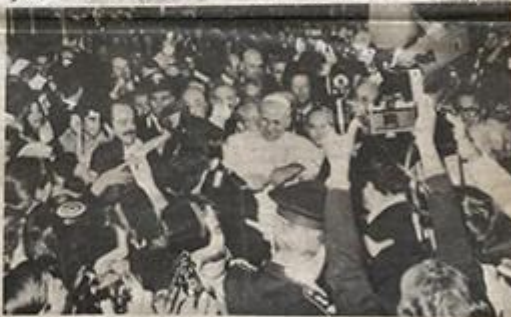
HAIKUT AI OCHARD LANE, Mich., Seminary