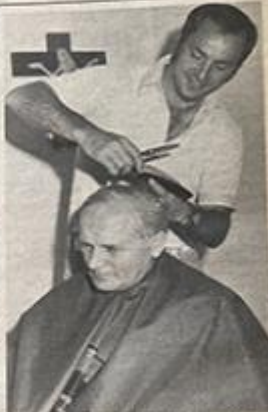
John Paul II