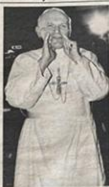
John Paul II