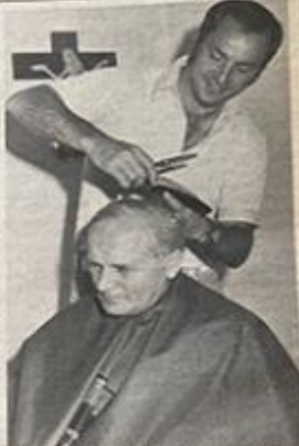
John Paul II

Haircut at Orchard Lake, Mich., seminary.