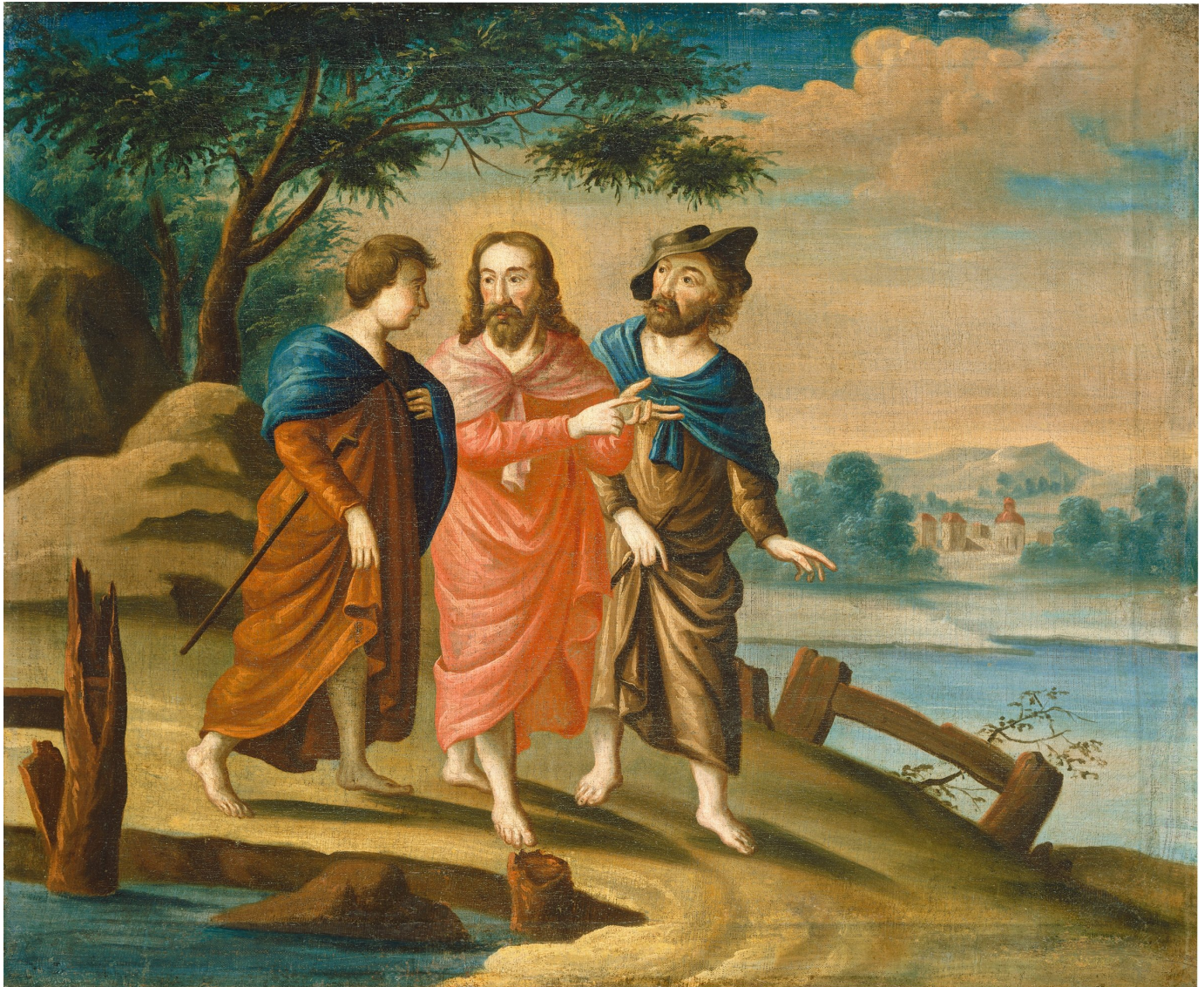
"Christ on the Road to Emmaus," c, 1725/1730.