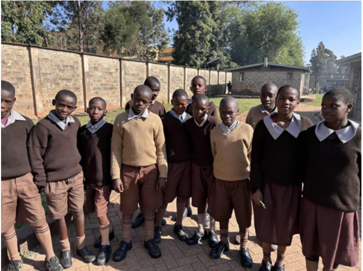
Students at the Amani School pose for a group photo.