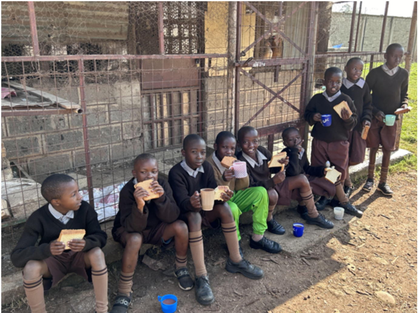
Amani School students eating

Donors heard of this new school for street children and began contributing towards its success. Eventually the school grew to include students from grades one to eight. The sisters and lay teachers continue to stay in contact with the families of the children and assess the families' needs. Today the school's services include social services, home visits, a feeding program, rehabilitation and counseling. Every day, the students are provided with breakfast, lunch and a snack before they go home. Some of the children were on the streets because they had been orphaned and had no family to care for them, so foster homes were found for them.