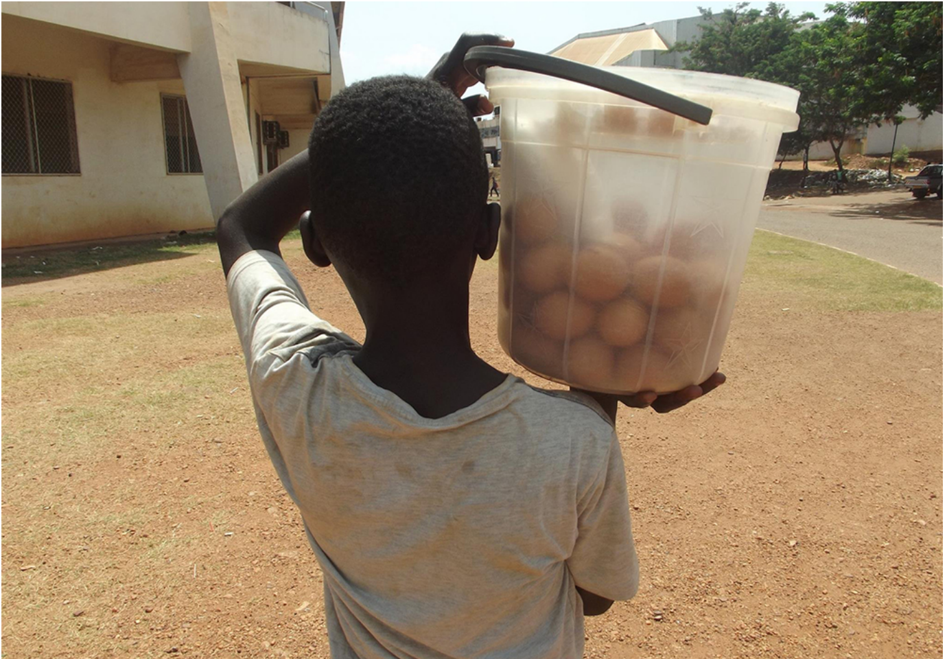
A boy sells eggs on the streets of Bangui, Central African Republic, in April 2021.