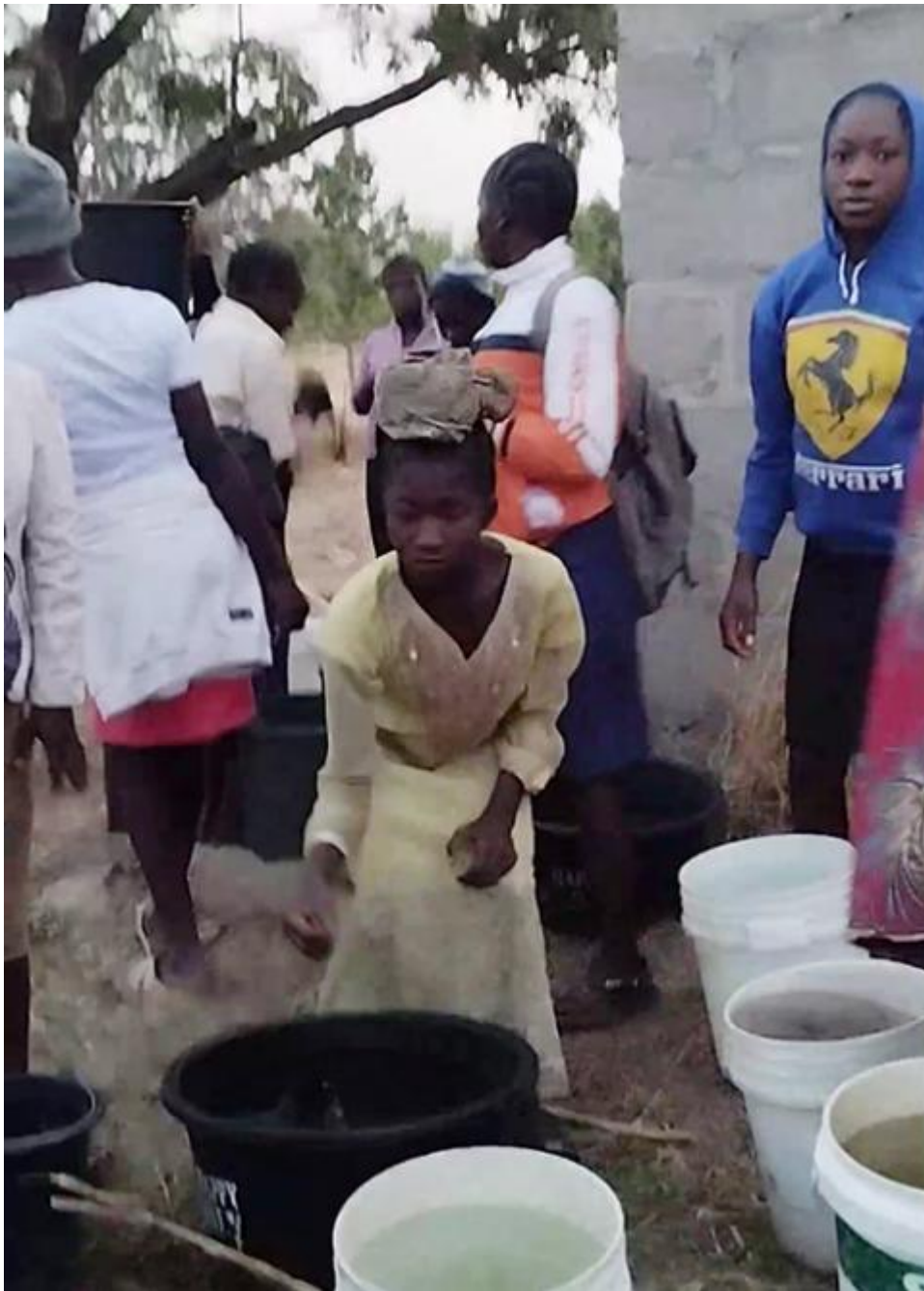
Members of a community in Nigeria assisted by the Mercy Girl Effect gather to collect water.

For example, a 2023 report by UNICEF and the World Health Organization noted, "Globally, 1.8 billion people live in households without water supplies on the premises. Women and girls aged 15 and older are primarily responsible for water collection in 7 out of 10 such households, compared with 3 in 10 households for their male peers." Such a role often prevents them from attending school.