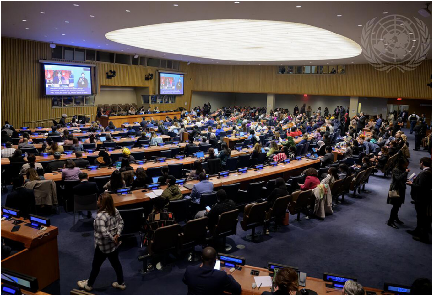
A view of the third plenary meeting of the United Nations' 69th session of the Commission on the Status of Women

These forms of violence "all have a common root cause: deeply entrenched gender inequality and discriminatory norms," according to the report, echoing what Augustine, Kumari and numerous speakers said at the commission. "The response to violence against women and girls has yet to meet the scale of the problem," particularly in an era described as one of "misogynistic backlash."