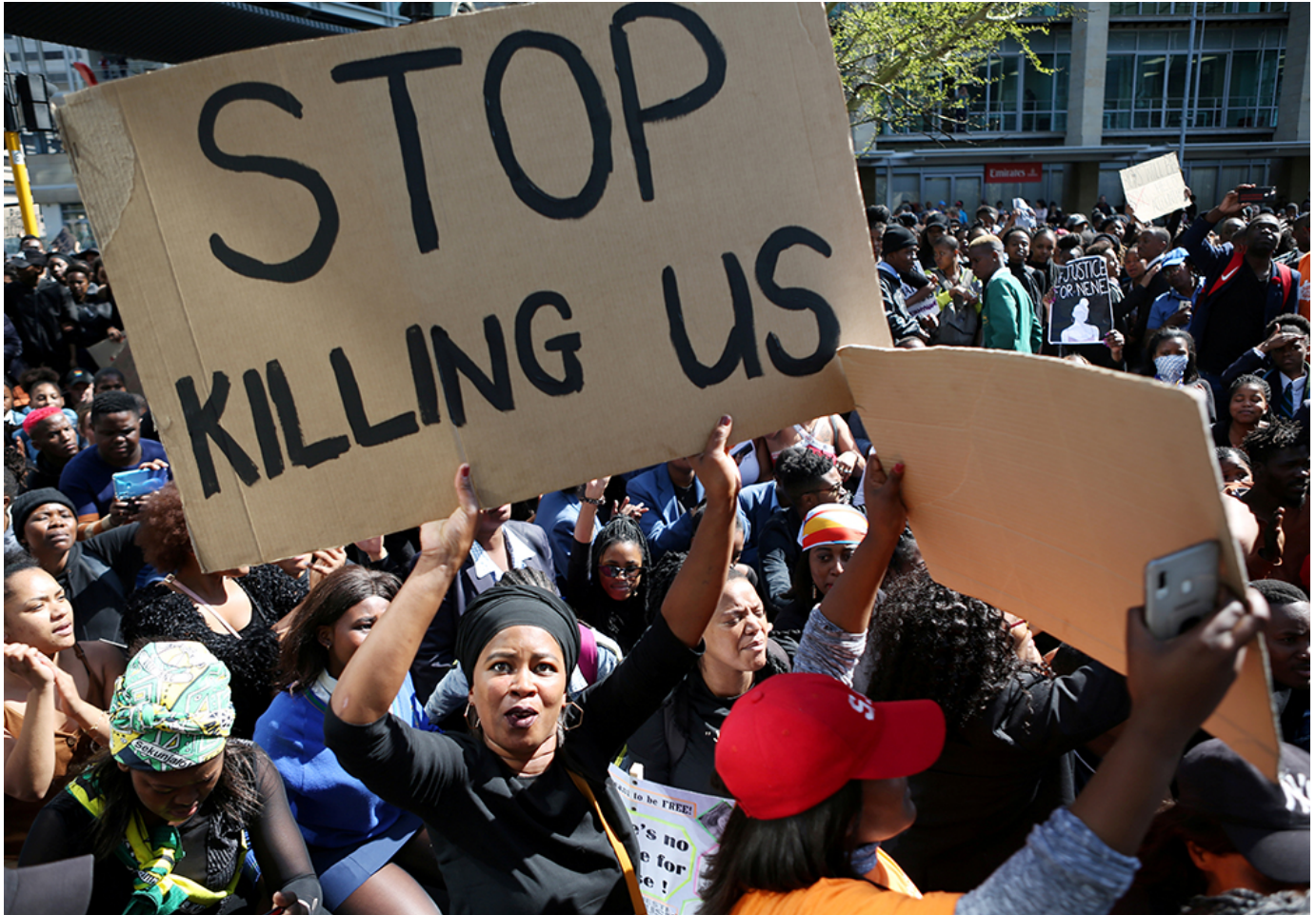
A woman holds a sign as demonstrators gather Sept. 4, 2019, at the World Economic Forum on Africa in Cape Town during a protest against gender-based violence.

"This is not a 'Haitian problem,' " she said. "We are all in danger. This is a global problem."