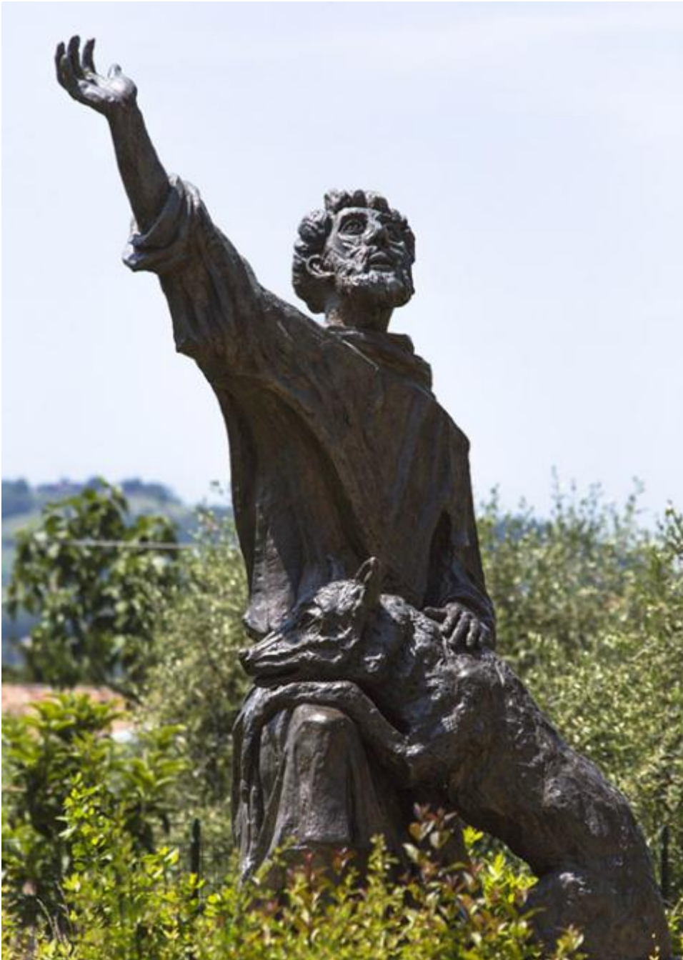
A statue of St. Francis of Assisi and a wolf is seen May 30, 2015, in the town of Gubbio, Italy.

In Italy, for example, the reintroduced grey wolves of the Apennine Mountains have become crucial to maintaining a healthy balance by controlling deer populations that might otherwise overgraze plants and disrupt the ecosystem. The same is true in America's Yellowstone National Park and Isle Royale National Park.