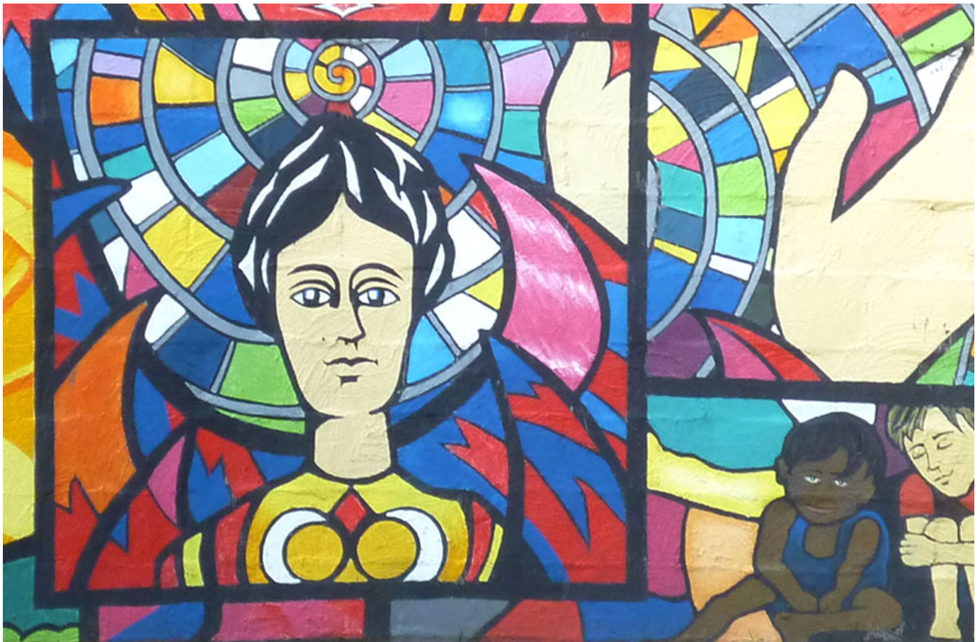
A mural depicts Sr. Nano Nagle, foundress of the Sisters of the Presentation of the Blessed Virgin Mary, at St. Edward the Confessor Catholic School in Daisy Hill, Australia.

After Vatican II, we rejoiced knowing the church was no longer merely a disciplinary, controlling structure, but God's holy people. Teaching my students was about God's loving kindness, not the fear of God.