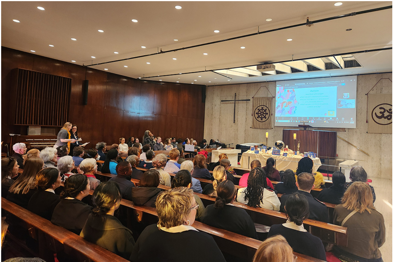
An opening prayer service on March 10 at the chapel of the Church Center for the United Nations during the first day of the 69th Commission on the Status of Women at the U.N.

That was implicit in presentations Catholic sisters and others made during numerous parallel events held outside U.N. headquarters.