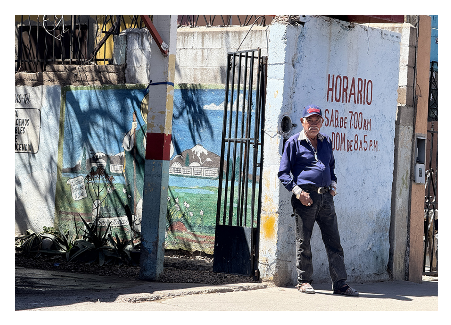
A man stands outside a business in Nogales, Mexico, on April 5 while watching a Via Crucis procession pass through the street facing the border wall. (Anita Snow)