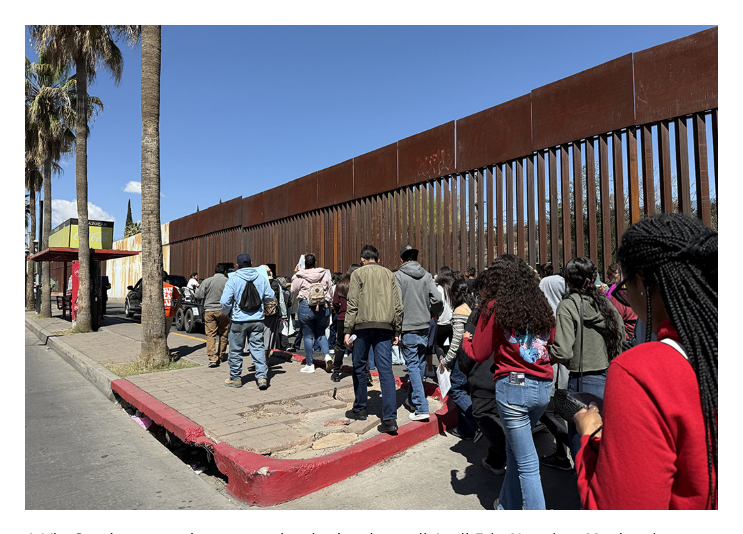
A Via Crucis procession passes by the border wall April 5 in Nogales, Mexico, in a nod to the sufferings of migrants.