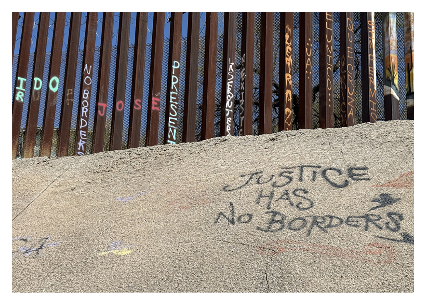
Pro-migrant messages spray-painted along the border wall that participants passed during a symbolic Via Crucis in Nogales, Mexico, on April 5 (Anita Snow)