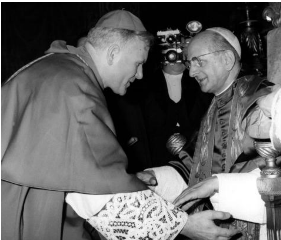
Cardinal Karol Wojtyla, who later became Pope John Paul II, is congratulated by Pope Paul VI at his installation as cardinal in the Sistine Chapel June 26, 1967.